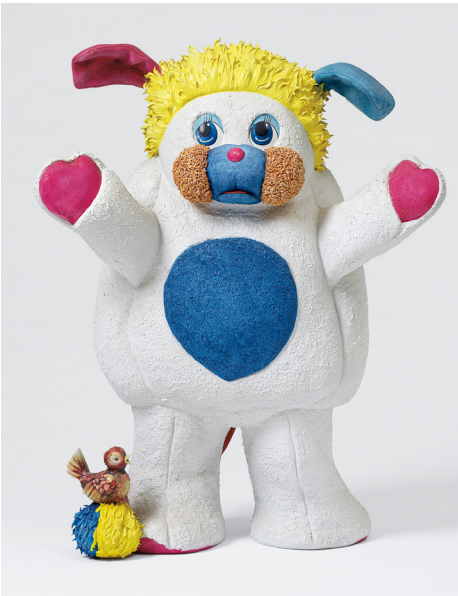
JEFF KOONS Popples , 1988 ESTIMATE $4,000,000 - 6,000,000

The sensuous surface of Gerhard Richter's Mädchen im Sessel (Lila) , 1964 is a dazzling composition that transcends the abstraction of form. Richter's pulsating depiction of a young woman posed in an armchair is a timeless image of feminine beauty and youth. Executed at a moment when the artist was devising a new vision for traditional painting, Mädchen is a testament to Richter's reputation as our greatest living painter.