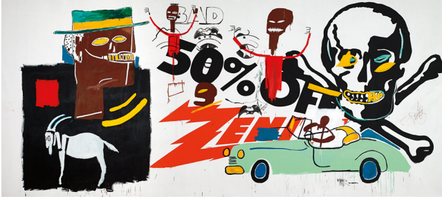
ANDY WARHOL AND JEAN-MICHEL BASQUIAT Zenith , 1985 ESTIMATE $10,000,000 - 15,000,000

Zenith , 1985, a monumental painting, and the largest work by this dynamic artistic duo, represents the two masters at the height of their combined prowess. Addressing themes central to their oeuvres, such as social commentary and poignant meditations on the brevity of life, the composition prominently features a graphic skull and crossbones embellished with jewel tones. Zenith is the epic manifestation of two masters' artistic vision, as Warhol and Basquiat engaged in dialogue that is among the most renowned artistic collaborations of all time.