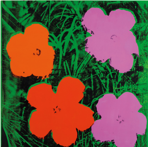
ANDY WARHOL Flowers , 1964 ESTIMATE $10,000,000 - 15,000,000

Zenith , 1985, a monumental painting, and the largest work by this dynamic artistic duo, represents the two masters at the height of their combined prowess. Addressing themes central to their oeuvres, such as social commentary and poignant meditations on the brevity of life, the composition prominently features a graphic skull and crossbones embellished with jewel tones. Zenith is the epic manifestation of two masters' artistic vision, as Warhol and Basquiat engaged in dialogue that is among the most renowned artistic collaborations of all time.