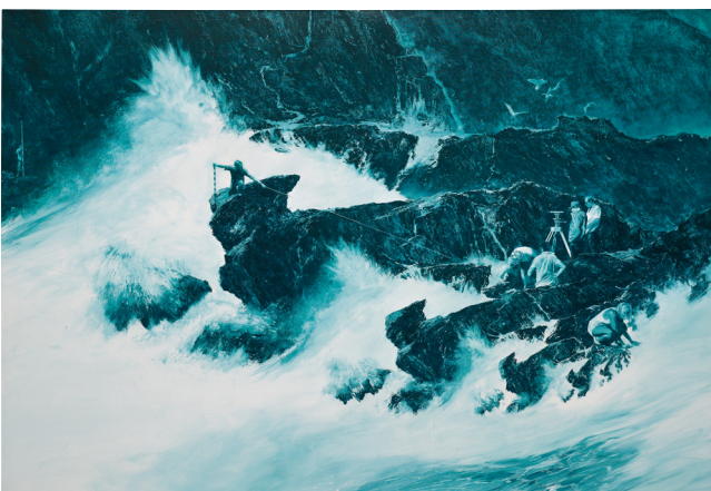
MARK TANSEY Coastline Measure , 1987 ESTIMATE $3,500,000 - 4,500,000

Jeff Koons, a standard-bearer for the Pop Art tradition, deftly melds luxury and popular culture in a manner that has transformed him into one of the most recognized contemporary artists in the world. From Koons' Banality series, Popples was conceived as a central figure in a global statement of contemporary allegory. The exquisitely rendered porcelain surface creates a startling tromp l'oeil that confounds our expectations of medium and tactility. Popples is an outstanding example of the artist's unique vision of a youthful and commercially-driven culture.