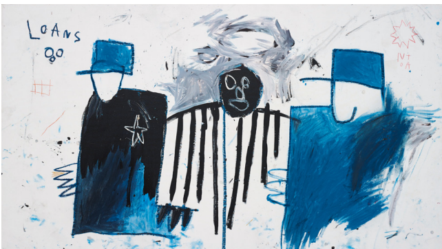
JEAN-MICHEL BASQUIAT Untitled , 1981 ESTIMATE $8,000,000 - 12,000,000

Flowers , 1964, is an electric rendering of one of Warhol's most enduring subjects. The work represents the bold optimism of 1960's America and the Pop Art movement. Warhol's blossoms, silkscreened in vibrant tones of purple, orange and red, set against a verdant field of green. This example is among the most important of his Flowers series and will attract today's most ardent enthusiast.