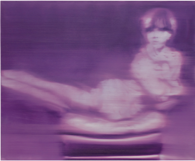
GERHARD RICHTER Mädchen im Sessel (Lila) , 1964 ESTIMATE $6,000,000 - 8,000,000

The sensuous surface of Gerhard Richter's Mädchen im Sessel (Lila) , 1964 is a dazzling composition that transcends the abstraction of form. Richter's pulsating depiction of a young woman posed in an armchair is a timeless image of feminine beauty and youth. Executed at a moment when the artist was devising a new vision for traditional painting, Mädchen is a testament to Richter's reputation as our greatest living painter.