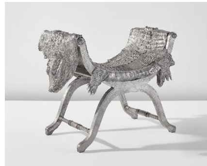
Claude Lalanne "Crococurule," 2009 Estimate: $100,000 – 150,000