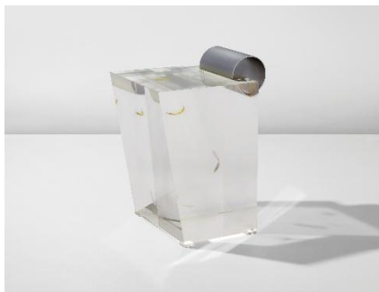
Shiro Kuramata "Acrylic Stool," designed for the Spiral boutique, The Axis Building, Roppongi, Tokyo, 1990 Estimate: $30,000 – 50,000