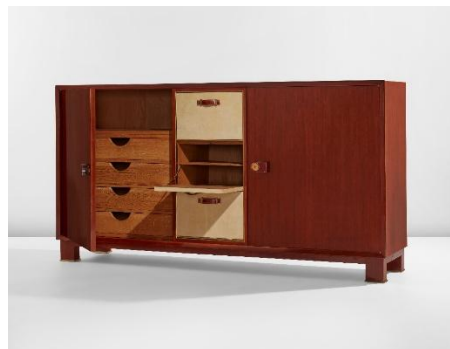
Paul Dupré-Lafon Cabinet, circa 1935 Estimate: $70,000 - 90,000