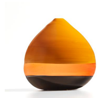
Thomas Stearns Vase with double incalmo glass, circa 1962 Estimate: $18,000 - 24,000