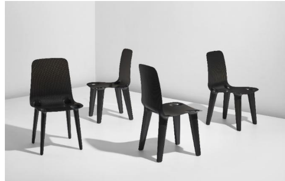
Marc Newson Set of four "Carbon" chairs, 2008 Estimate: $20,000 – 30,000