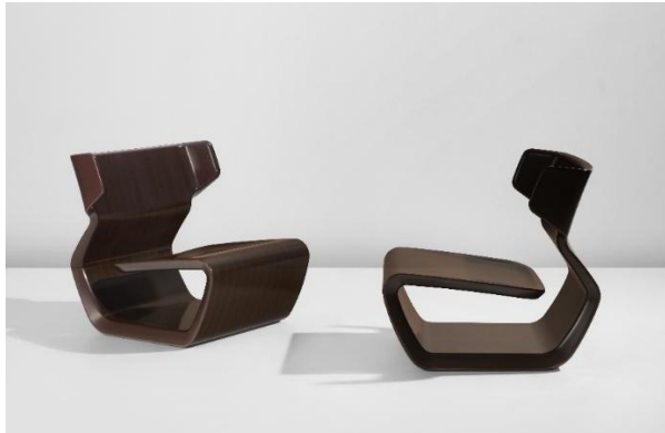
Marc Newson Pair of "Micarta" chairs, 2006 Estimate: $40,000 - 60,000