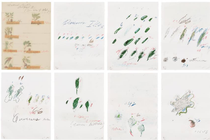
Cy Twombly Natural History Part II: Some Trees of Italy , 1975-76 Estimate: $40,000 - 60,000