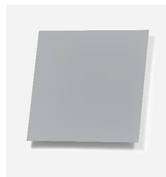
Ellsworth Kelly Gray Panel , from Painted Wall Sculptures , 1982 Estimate: $150,000 – 250,000

Ellsworth Kelly's rare-to-market Gray Panel isolates a single color on a skewed quadrilateral form. The artist initially conceived of the sculptures as a print project, first choosing lithography to execute this examination of shape and color. However, as the forms were further developed and refined, it became clear that greater power and unity would be possible if the work took form as metal rather than paper. The translation of the shapes and colors from the lithographs into aluminum painted wall sculptures was a meticulous process, requiring mechanical precision to prevent the shapes from warping and special surface preparation to make the colors match. The resulting panels blur the distinctions between painting, sculpture, and multiple, evoking qualities of all three simultaneously. The work's minimal surface hovers between flatness and infinite depth, while the panel's two-dimensions cast a subtle, geometric shadow that mirrors the tone of the panel itself.