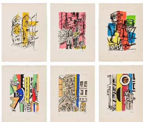
After Fernand Léger La Ville (The City) , 1959 Estimate: $5,000 – 7,000

Following the inaugural MODERNISM 1880 – 1960 sale in April, the period is again represented this June with vibrant works in primary colors by Alexander Calder, including Pennants (1965), a rhythmic abstraction that evokes waving flags, pinwheels, and sunsets. Also included are etchings by Pablo Picasso and portfolios by modern masters, including Marc Chagall's The Story of the Exodus (1966) and Fernand Léger's complete set of lithographs La Ville (The City) (1959).