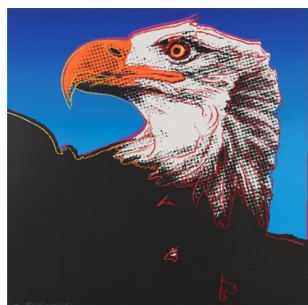
Andy Warhol Bald Eagle , from Endangered Species , 1983 Estimate: $90,000 – 120,000

A selection of works by Andy Warhol will also be featured, including Bald Eagle (1983) from his Endangered Species portfolio, here with a classic ombre blue background, and Green Pea from his iconic Campbell's Soup I portfolio. Also on offer is KAWS' bronze multiple FINAL DAYS (2017), Yves Klein's Table Bleue Klein™ / Klein Blue (1961), as well as Glenn Ligon's Untitled (Four Etchings) (1992), 1989: A Portfolio Honoring Artists with AIDS by various artists (2000), and Julian Opie's Running Women , from Runners (2016).