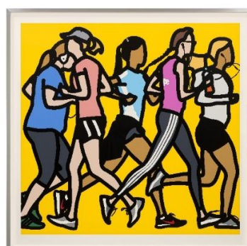
Julian Opie Running Women , from Runners , 2016 Estimate: $15,000 – 25,000