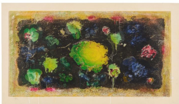
Joan Snyder Blake Lake Redux, 2021 Estimate: $700 – 1,200

Also holding a place of pride in the sale are five unique prints with hand additions by New York artist and printmaker Joan Snyder, spanning four decades of her prolific career. Similar to her paintings, these prints can be described as narrative abstractions containing elements of her idiosyncratic visual vocabulary that at once conveys the