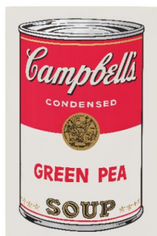
Andy Warhol Green Pea , from Campbell's Soup I , 1968 Estimate: $30,000 – 50,000