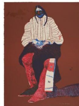
Fritz Scholder Indian with Beaded Sash, from Suite Fifteen, 1975 Estimate: $2,000 – 4,000

artists through her fearless exploration of emotion, politics, and autobiography. Her prints, like her canvases, are layered with meaning and texture, offering a visceral and poetic reflection of both the personal and the political.