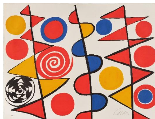
Alexander Calder Pennants , 1965 Estimate: $1,500 – 2,500