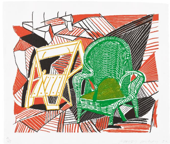
David Hockney Two Pembroke Studio Chairs , from Moving Focus , 1984 Estimate: $15,000 - 25,000

NEW YORK – 3 JUNE 2025 – Phillips is pleased to announce highlights from the Editions & Works on Paper auction taking place 24 June 2025 in New York. A preview of the sale, on view 17 – 23 June, features a varied and unique selection of print highlights on offer. From Sam Francis' manipulated monumental monotype, Untitled , to David Hockney's smart and studious Two Pembroke Studio Chairs from Moving Focus , there is something for collectors of all interests.