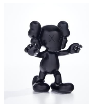
KAWS FINAL DAYS , 2017 Estimate: $20,000 – 30,000

Following the inaugural MODERNISM 1880 – 1960 sale in April, the period is again represented this June with vibrant works in primary colors by Alexander Calder, including Pennants (1965), a rhythmic abstraction that evokes waving flags, pinwheels, and sunsets. Also included are etchings by Pablo Picasso and portfolios by modern masters, including Marc Chagall's The Story of the Exodus (1966) and Fernand Léger's complete set of lithographs La Ville (The City) (1959).