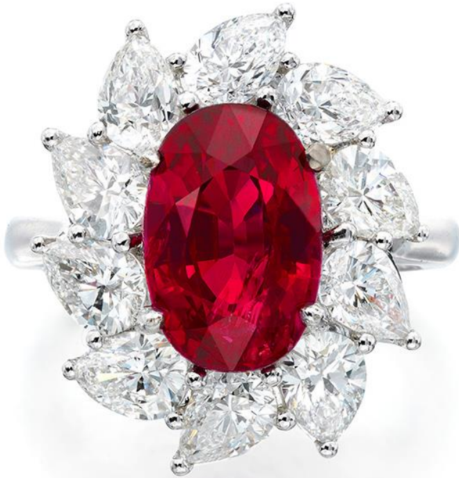
Exceptional Ruby and Diamond Ring, 'The Red Dragon' Estimate: $1,000,000 - 1,500,000

Auction to Also Feature A Stunning Selection of Colored and Colorless Diamonds, Alongside Important Signed Pieces by Cartier, Van Cleef & Arpels, and Tiffany & Co, Among Others