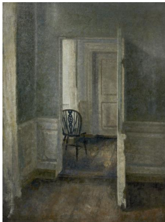
Vilhelm Hammershøi Interior with Windsor Chair at Strandgade 25, 1913 Estimate: $2,500,000-3,500,000 To be Offered in the Evening Sale of Modern & Contemporary Art, May 2026, New York

The Loeb Collection boasts some of the greatest examples by women artists of the Modern Breakthrough in Danish art. Bertha Wegmann’s resplendent scene of a young woman sitting in a boat combines the influence of the French Impressionists with the unique qualities of Scandinavian light. The Collection includes several works