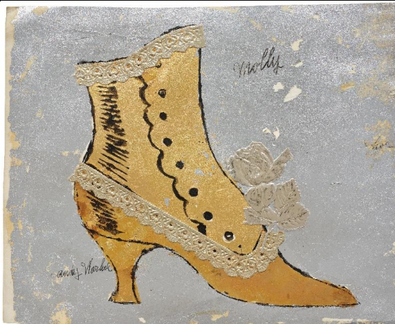
Andy Warhol Molly , 1956 Sold for $412,800