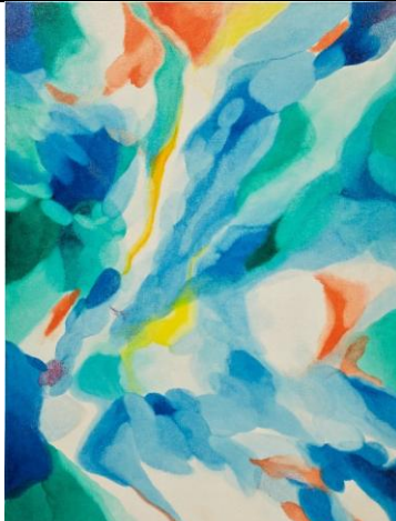
Alice Baber Ladder over and under , 1972 Sold for $387,000