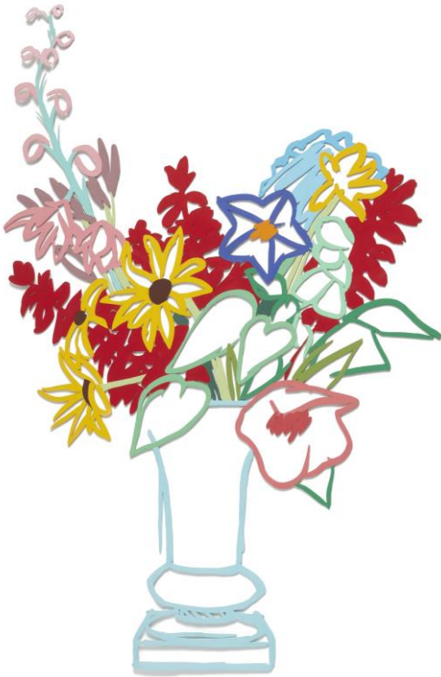
Tom Wesselmann, Country Bouquet (W.P.I. E35) , 1989 Sold for $292,100