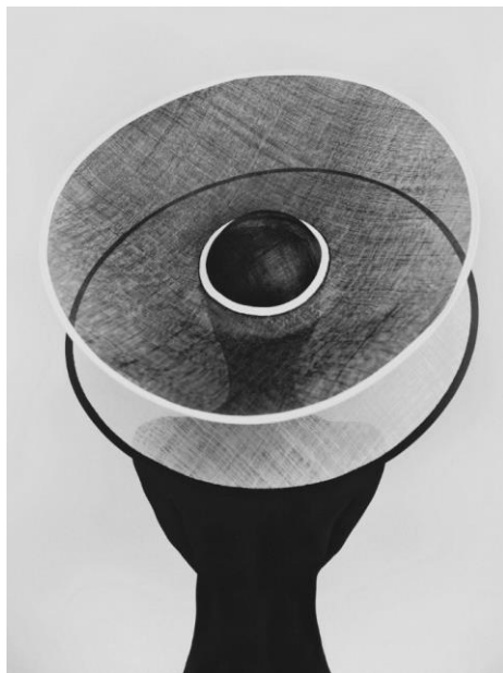
Twice , 2021

Woudt's work is a testament to his meticulous craftsmanship, notably his mastery of monochrome imagery. With an intricate play of light and shadow, he captures the essence of subjects through intentional contrasts. The choice of black and white is not merely an aesthetic preference but a deliberate decision to strip away distractions, allowing viewers to immerse themselves in the form, structure, and materiality of each image by Woudt.