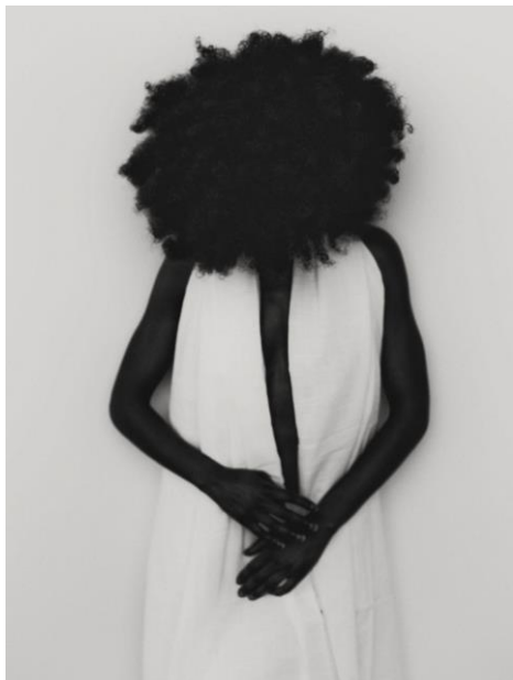
Tinotenda III , 2015