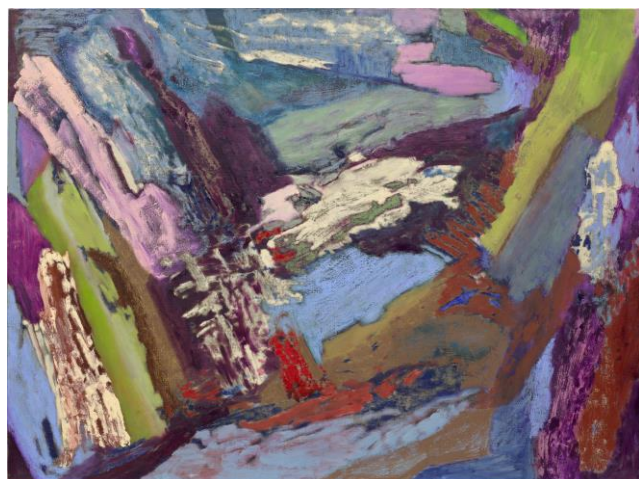
Annice Fell Unstirred, 2024 47 x 63 in (120 x 160 cm)