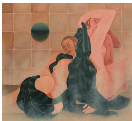
Laura Berger The Steam Bath, 2024 42 x 38 in (106 x 96 cm)