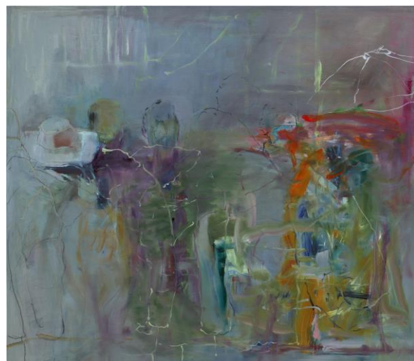
Tianyue Zhong Evaporated yet?, 2024 67 x 58 in (170 x 147 cm)