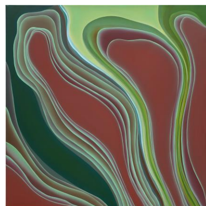
Bethany Czarnecki Whispering Frond, 2024 48 x 48 in (122 x 122 cm)