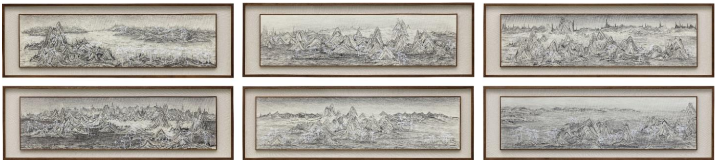
Composition: A Thousand Miles of Rivers and Mountains 1-6, 2020-2021 (On Loan for the exhibition)