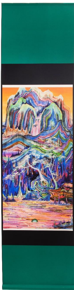
Endless miles of mountains and streams, 2024 This work is from an edition of 66 (Available for sale)

In addition to a series of exquisite works that express Huang Yuxing's passion for traditional Chinese landscape and craftsmanship, this exhibition also offers a work from the artist's well-known Bubble series. This series of works joyfully depicts Huang Yuxing's profound reflections on the experiences of time and space through visual metaphors of organic life forms. The Bubble series is an unapologetic celebration of Huang Yuxing's deep reflection on the human experience in time and space. Huang's artistic practice entails a long-running investigation into the individual's life experience in parallel to the natural world. Stemming from reoccurring motifs of rivers and swirls in the artist's oeuvre, the Bubble series discusses the topic of dissolution, demonstrating a sense of eternity that underlies the ephemeral existence of bubbles themselves. The human experience is visually represented as bubbles caught in various states of motion, as fleeting and volatile as the temporary existence of an individual's life. Huang's signature approach during this period was to superimpose geometric forms delineated in thinly veiled neon colours to create delicate depth and texture, which is well-demonstrated in Bubbles .