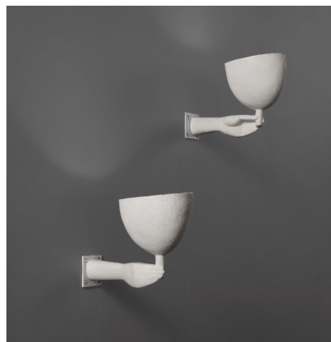
Alberto Giacometti Pair of rare "Main Tenant une Coupe" wall lights, circa 1931 Estimate: $200,000 - 300,000

Alberto Giacometti's wall lights also feature as an important highlight in the auction. Before dedicating himself to figural portraits in bronze, Giacometti enjoyed a productive tenure as a designer, creating expressive objects of utilitarian use. He designed the present lot, along with several other domestic accessories and furnishings, in partnership with acclaimed French interior designer Jean-Michel Frank. A fixture amongst the Surrealists, Giacometti drew upon the