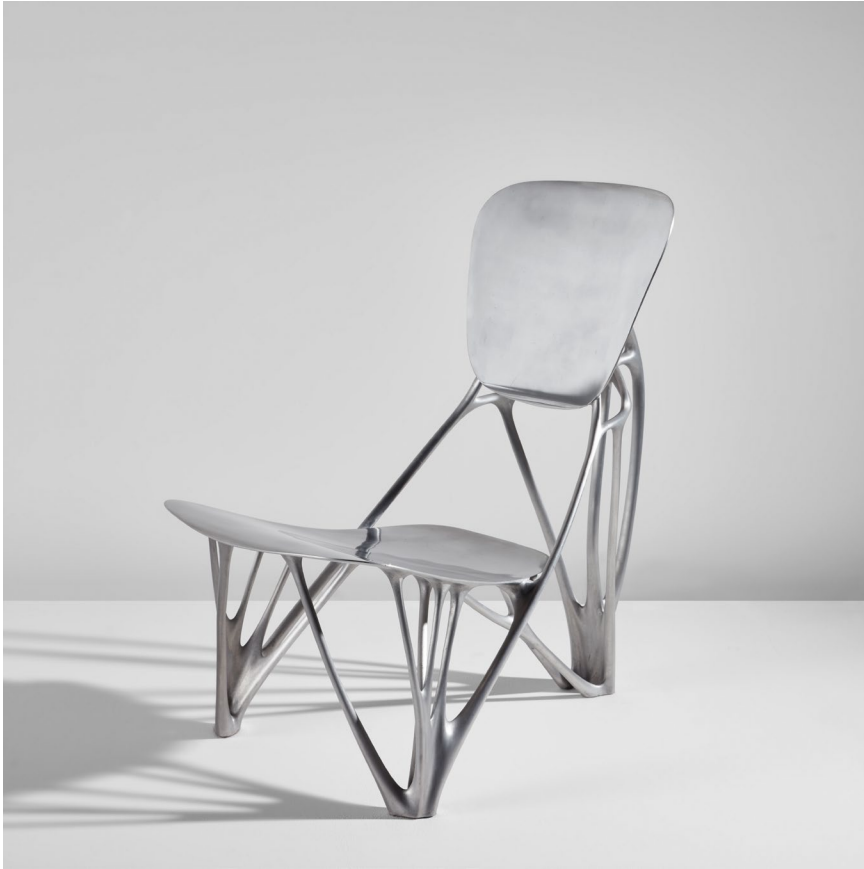
Joris Laarman "Bone" chair, 2006 Estimate: $500,000 - 700,000

Sale on 7 June to Feature Works by Alberto Giacometti, François-Xavier Lalanne, Joris Laarman, Shiro Kuramata, Harry Bertoia, and Ron Arad