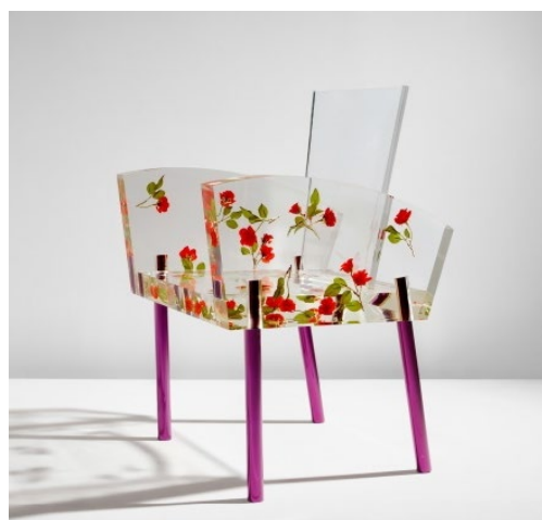
Shiro Kuramata "Miss Blanche" chair , designed 1988, executed before 1991 Estimate: $250,000 - 350,000

Shiro Kuramata is widely admired for his ability to free his designs from gravity and use materials in ways that defied convention. Kuramata discovered design during his time at the Teikoku Kiz ai Furniture Factory in Arakawa-ku in 1954. By 1965, at the age of 31, he opened his own firm: Kuramata Design Office. His dynamic use of materials, particularly those that were transparent, combination of surfaces and awareness of the potential of light in design led him to create