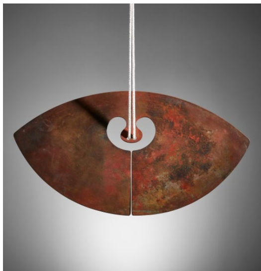
Harry Bertoia Suspended gong , 1970s Estimate: $25,000 - 35,000