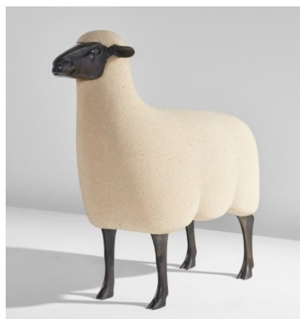
François-Xavier Lalanne "Mouton de Pierre" , designed 1979, executed 1988 Estimate: $300,000 - 500,000

leitmotifs of the movement, employing fragmentation and iconography in his work. The present lot renders the eponymous fist holding a scone in the precarious grasp of its fingertips. François-Xavier Lalanne's Mouton de Pierre represents a significant work in the artist's oeuvre , a fantastic menagerie of creatures. Most art historians and critics often cite surrealism as Lalanne's primary creative influence; however, the original series title, Pour Polythème (For Polythemus) , is a reference to Homer's Odyssey . The cyclops Polythemus imprisons Odysseus and his compatriots, who escape their captivity by clinging onto the bellies of the monster's giant sheep. This vignette in the epic poem was a favorite subject amongst Baroque painters and the subject is likely a reference to Lalanne's tenure as a security guard at the Louvre, where he encountered ancient Assyrian and Egyptian sculptures of fauna. Lalanne initially made his sheep from bronze and wool,