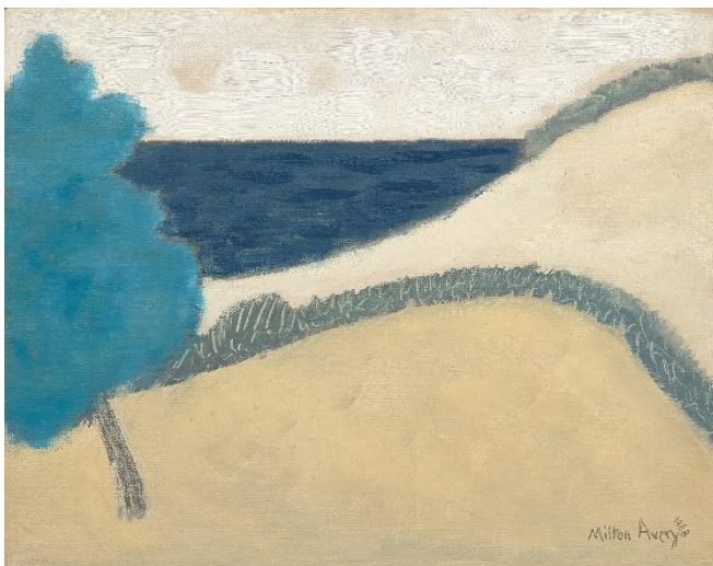
Milton Avery Tree by the Sea , 1958 Estimate: $150,000 – 250,000