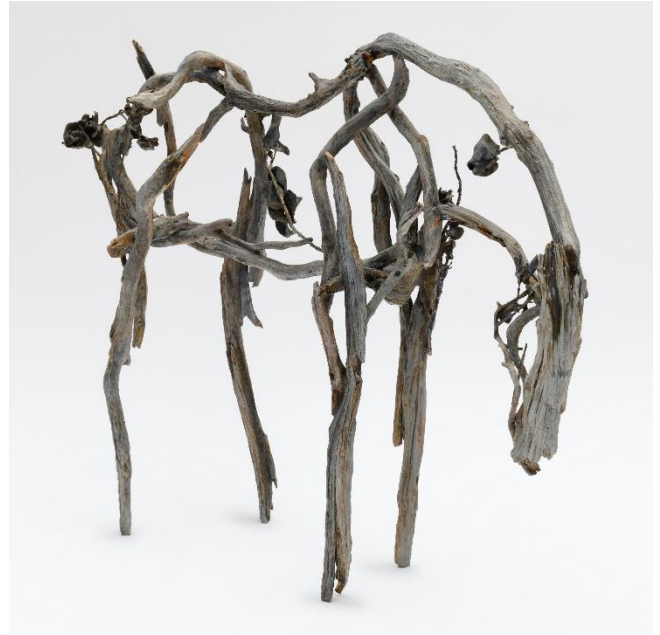
Deborah Butterfield Untitled Estimate: $50,000 – 70,000