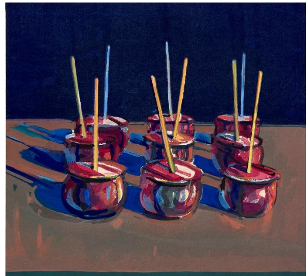
Wayne Thiebaud Candy Apples , 1987 Estimate: $30,000 – 50,000