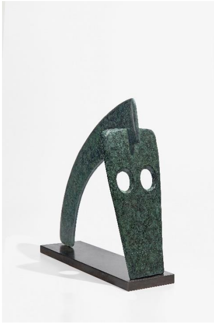
William Turnbull Horse 2 , executed in 1987 Estimate: $200,000 – 300,000