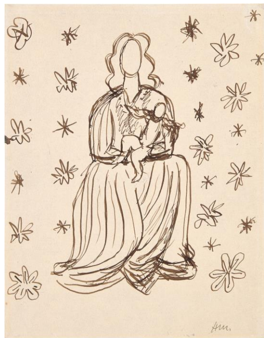
Henri Matisse Vierge à l'enfant , 1948 Estimate: $50,000 – 70,000