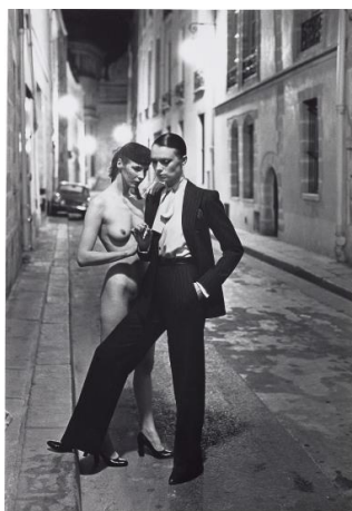
Helmut Newton Rue Aubriot, Paris, 1975 Estimate £20,000 - 30,000