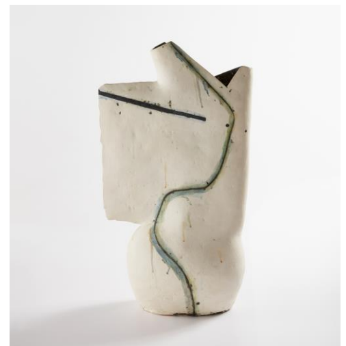
Gordon Baldwin Standing Form , 1986 Estimate: $6,000 - 8,000

Hailed as one of the most celebrated artists in the sculptural ceramics movement, six works by Gordon Baldwin are featured in the sale. Seeking to develop ceramics beyond utilitarian function, Baldwin dedicated his early career to hand-building abstract sculptural forms, experimenting with form and gestural surface decoration, as appreciable in Standing Form and Monad . In a continuation of his abstract sensibility, later series conjured the vessel form, re-defining the corporeal borders of the shape. Baldwin washes many works in exclusively black or white glazes, referring to these dichotomous tones as his inner and external beings, respectively. Baldwin's work is held in the permanent collections of the British Museum, London, the Metropolitan Museum of Art, New York, and the Museum Boijmans van Beuningen, Rotterdam, amongst several others.