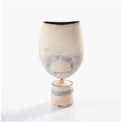
Hans Coper "Cycladic" pot , circa 1972 Estimate: $40,000 - 60,000

Coming out of the last phase of Hans Coper's career, the present "Cycladic" pot shows the reduced scale of his later works, recalling the clay figures of Bronze Age Greece, a primeval style that Coper is acclaimed for. Ensconced amongst the greatest contributors to modern English pottery, Coper learned his craft in the London studio of Lucie Rie, having emigrated from Germany as a young Jewish engineering student in 1939. Coper favored compound shapes that, while simple in appearance, were in fact complex in construction. He would build his vessels by bringing several thrown forms together, for example joining bowls rim to rim. Coper eschewed glazes, preferring the textured surfaces achieved through the application of white and black slips, which evoke the abraded texture of excavated vessels. This interest in ancient objects was very much in step with other modernists of his time—Coper admired Constantin Brancusi and Alberto Giacometti and his textured markings have been compared to sculptors such as William Turnbull.