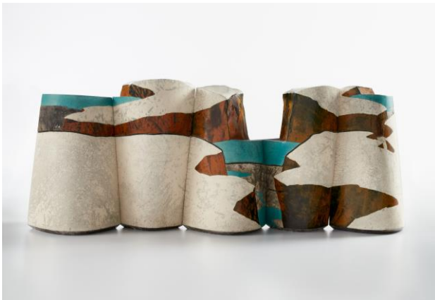
Wayne Higby "Cathedral Canyon" , 1985 Estimate: $15,000 - 20,000