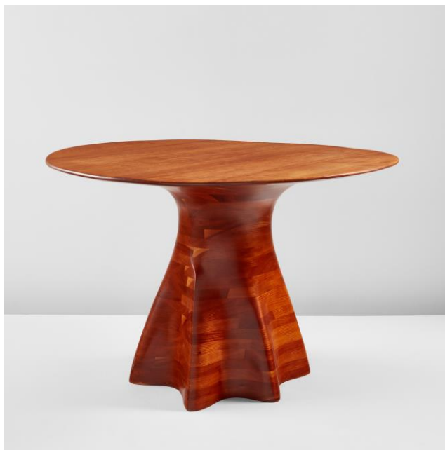
Wendell Castle Center table , 1973 Estimate: $50,000 - 70,000

Wendell Castle's Center table and three other works featured in this sale are exemplary of his various explorations in the stack-laminate technique, a method honed shortly after completing his training in 1961 from the University of Kansas. This technique involves the stacking of wooden sheets upon one another, enabling the woodworker to carve complex shapes and sinuous lines from the amalgamated material. Utilizing this process, Castle sculpted fantastic and winsome pieces, each one a sculptural masterpiece and a functional object. He was amongst the most outstanding contributors to his craft, committing his nearly six-decade career to expanding the boundaries of the field.