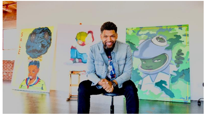
Hebru Brantley

Hebru Brantley creates narrative-driven work revolving around his conceptualized iconic characters which are utilized to address complex ideas around nostalgia, the mental psyche, power, and hope. The color palettes, pop-art motifs, and characters themselves create accessibility around Brantley's layered and multifaceted beliefs. Majorly influenced by the South Side of Chicago's Afro Cobra movement in the 1960s and 70s, Brantley uses the lineage of mural and graffiti work as a frame to explore his inquiries. Brantley applies a plethora of mediums from oil, acrylic, watercolor and spray paint to non-traditional mediums such as coffee and tea. Brantley's work challenges the traditional view of the hero or protagonist and his work insists on a contemporary and distinct narrative that shapes and impacts the viewer's gaze. Find out more about the artist: https://www.hebrubrantley.com/ https://www.instagram.com/hebrubrantley/