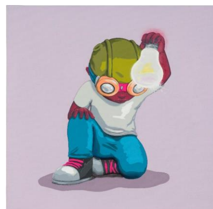
Hebru Brantley THE ULTRA LUMEN PT. 1 , 2021 acrylic, oil and spray paint on canvas 121.9 x 121.9 cm.