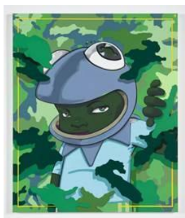
Hebru Brantley INTO THE WILD , 2020 acrylic, oil and spray paint on canvas 152.4 x 182.9 cm.