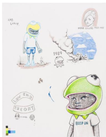
Hebru Brantley KAREN CALLED THE COPS , 2020 colored pencil on paper, 35.6 x 43.2 cm.