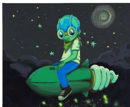
Hebru Brantley NIGHT FLIGHT , 2021 acrylic, oil and spray paint on canvas 112 x 91 cm.