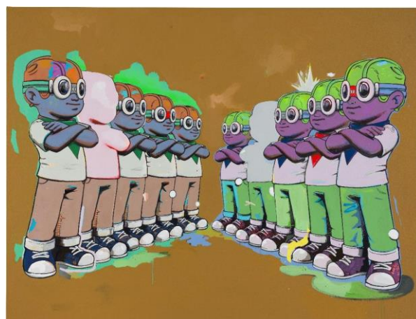
Hebru Brantley SPECIAL EPISODE OF THE GREAT DEBATE , 2019-2021 acrylic, oil and spray paint on canvas, 215.9 x 165.1 cm