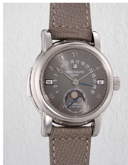
Patek Philippe Ref.5016, platinum minute repeating perpetual calendar tourbillon wristwatch Circa 1994 Estimate: HK$3,500,000 - 5,000,000/ US$450,000-650,000