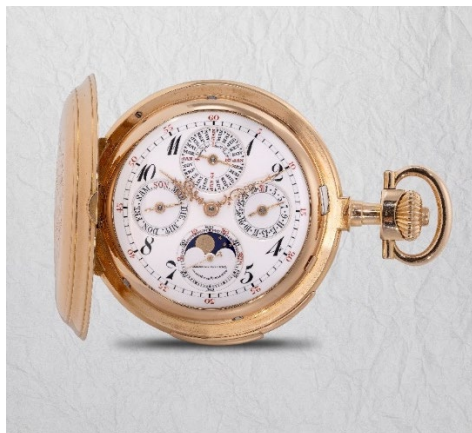
A. Lange & Söhne pink gold minute repeating perpetual calendar pocket watch Circa 1911 Estimate: HK$ 630,000 - 1,300,000/ US$80,000-160,000

The present Breguet pocket watch is a prime example, created during the Art Deco period. Encased in a remarkably rare two-tone 18K gold configuration, featuring both pink and white gold, this pocket watch is a true rarity in the world of Breguet horology. The elegant two-tone case of this Breguet pocket watch was crafted by the renowned Verger Frères, a master jeweler and horologist of the Art Deco era, as evidenced by the "V.F." stamp on the inner caseback.