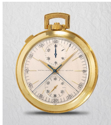
Patek Philippe Ref.837, yellow gold split-seconds chronograph open-faced keyless pocket watch Circa 1967 Estimate: HK$120,000-240,000/ US$15,000-30,000