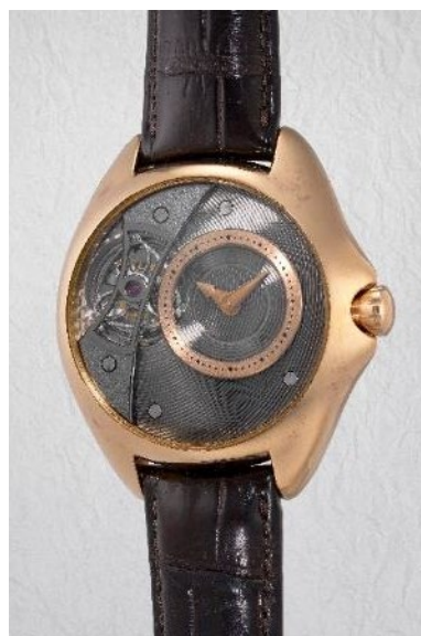
Masahiro Kikuno Unique pink gold tourbillon wristwatch Circa 2011 Estimate: HK$200,000-400,000/ US$25,000-50,000