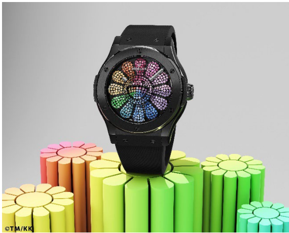
©TM/KK Hublot Classic Fusion Takashi Murakami Black Ceramic Rainbow Circa 2023 Estimate: HK$450,000/US$ 58,000

The 13th and highly anticipated final unique piece from Hublot and Takashi Murakami's groundbreaking series of watches is available as lot 100 in the TOKI: Watch Auction. This Classic Fusion Takashi Murakami Black Ceramic Rainbow bridges the worlds of watchmaking and contemporary Japanese art, and all proceeds from the sale of this unique piece will be donated to Fond'Action, a Swiss-based non-profit foundation. Along with the unique