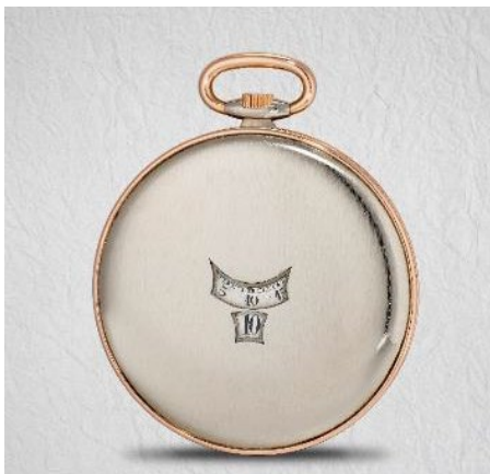
Breguet White gold and pink gold open-faced keyless digital pocket watch Circa 1926 Estimate: HK$150,000 - 320,000/ US$20,000-40,000