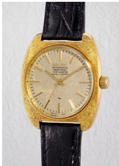
Seiko Astronomical Observatory Chronometer in yellow gold Circa 1970 Estimate: HK$160,000 - 310,000/ US$20,000-40,000