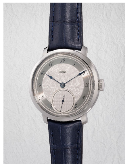
Masa's Pastime Nayuta Model A, unique stainless steel wristwatch Circa 2024 Estimate: HK$150,000 - 300,000/ US$20,000-40,000