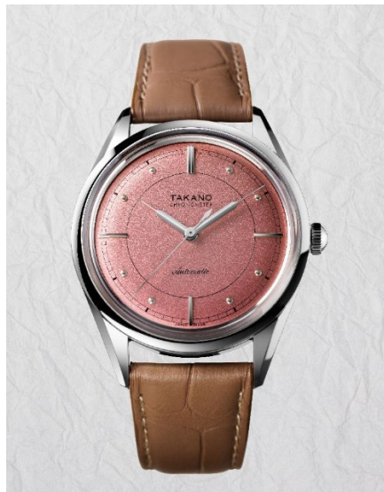
Takano Chateau Nouvel Chronometer “Toki” unique stainless steel wristwatch Circa 2024 Estimate: HK$50,000 - 100,000/ US$6,400-13,000