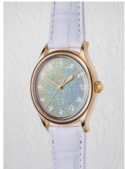
Kurono Tokyo by Hajime Asaoka Grand Niji “虹” unique pink gold wristwatch Circa 2024 Estimate: HK$70,000-140,000/US$9,000-18,000