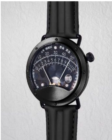
Otsuka Lotec by Jiro Katayama No.6 “SHINONOME” unique stainless steel semi-skeletonized wristwatch Circa 2024 Estimate: HK$ 15,000 - 45,000/ US$2,000-4,000

Kurono Tokyo’s “Grand” series pays homage to traditional Asian craftsmanship with its incredible Urushi lacquered dials. This ancient lacquer technique utilizes the filtered sap of the lacquer tree, a miraculous substance that absorbs moisture from the air as it hardens, resulting in a perpetually shiny and slick surface. Over time, Urushi becomes harder and more scratch-resistant, with the curing process continuing even after initial manufacture. The lacquer brightens with age as it loses moisture, which is a transformation that can take years. Also depending on the environment, the Urushi dial may change color, creating a unique piece of its own. The present Grand Niji “虹” is a unique piece made for the TOKI: Watch Auction . While past Kurono timepieces have been crafted in stainless steel, this watch is elegantly made in 18K pink gold. The dial is a marvel to behold, featuring layers of rainbow-colored Urushi crafted by Megumi Shimamoto, who has previously worked on Kurono’s Urushi dials.