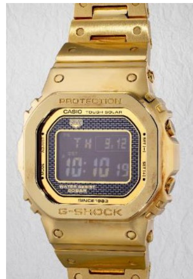
Casio G-Shock Dream Project “Pure Gold” ref. G- D5000-9JR solar-powered multifunction yellow gold wristwatch Circa 2021 Estimate: HK$200,000 - 400,000/ US$25,000-50,000