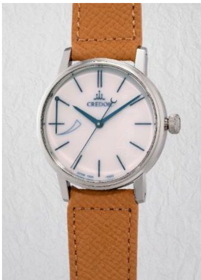
Credor Eichi, platinum wristwatch Circa 2010 Estimate: HK$ 280,000 - 430,000/ US$36,000-55,000

Magnificent and solid gold, the present G-Shock Dream Project “Pure Gold” G-D5000 watch was the first full yellow gold G-Shock launched in 2020 to celebrate Casio ’s 35th-anniversary legacy. Weighing a whopping 297g, only 35 pieces were made, all of which were initially allocated to collectors via ballot in Japan. Extremely sought-after, the model was sold out and has become one of the most coveted G-Shock models ever made. Its functions include world-time, alarm, stopwatch, timer, and it is solar-powered. Moreover, its packaging celebrates Japanese culture. Its Kiri-Bako (paulownia wood box) is stamped with a Hanko seal, which translates to “Gravity Dream Project.”