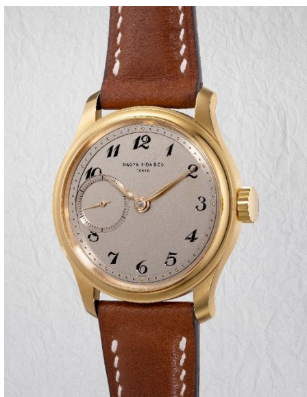
Naoya Hida & Co. Type 1D-2, unique yellow gold wristwatch Circa 2024 Estimate: HK$280,000 - 480,000/ US$35,000-60,000