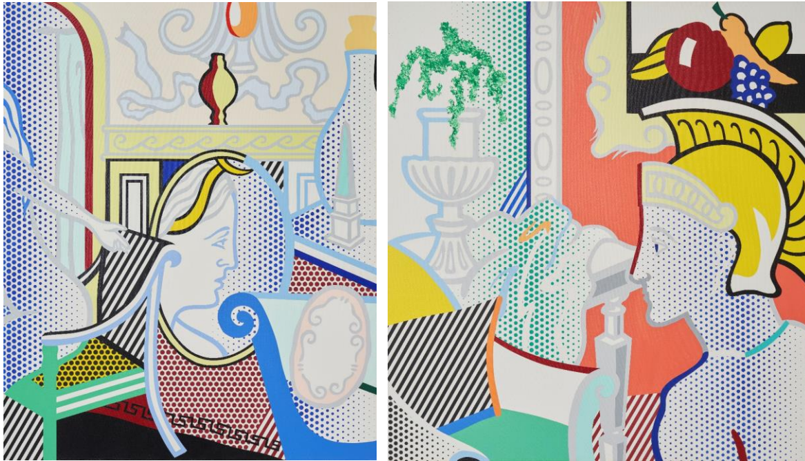
Roy Lichtenstein Interior with Diana and Interior with Ajax, 1997

On View from 12 August – 6 September in Southampton, Featuring Artworks Commissioned by Gianni Versace