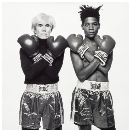
Michael Halsband Andy Warhol + Jean-Michel Basquiat #143, New York City, July 10th, 1985, 1985 Estimate £20,000 - 30,000