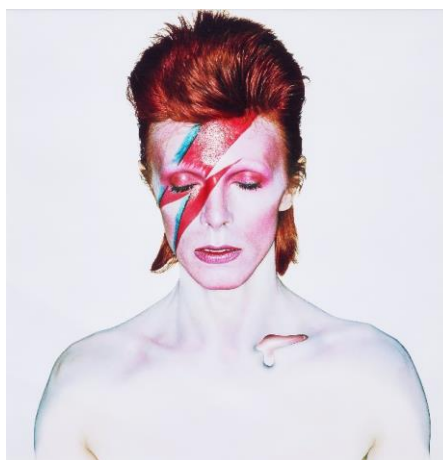
Brian Duffy David Bowie, 1973 Estimate £7,000 - 9,000