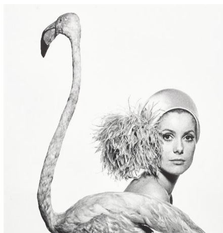
David Bailey Catherine Deneuve, Flamingo, 1966 Estimate £10,000 - 15,000