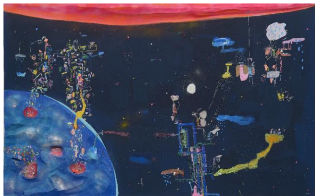
Rafa Macarrón Sin título (Cosmos) , 2015 mixed media on aluminium and PVC, 183 x 296 cm. Estimate: HK$700,000-1,000,000 / US$89,700-128,000