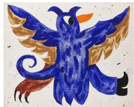
Szabolcs Bozó One bird, a cat and a man , 2020 acrylic and oil stick on canvas, 130.5 x 160.5 cm. Estimate: HK$400,000-600,000 / US$51,300-76,900