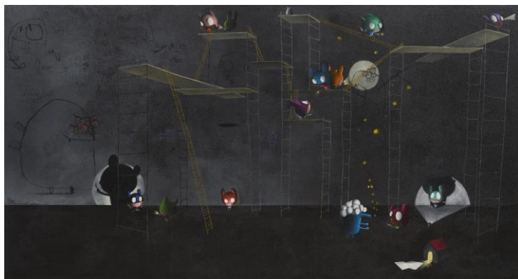
Edgar Plans Night Creatures , 2020 mixed media on canvas, 150 x 280 cm. Estimate: HK$1,200,000-1,800,000 / US$154,000-231,000

Sharing a comparable conceptual and visual approach, Spanish artists such as Javier Calleja, Edgar Plans, Rafa Macarrón, Adriana Oliver, and Matías Sanchez employ a similar mode of expression where the artists create childlike ideations of their own cast of creatures and characters to combat senses of loneliness, injustice or nostalgia, demonstrating a current trend of the Spanish New Wave within contemporary art. Phillips currently holds the world auction record for Javier Calleja, achieved last November when his multi-part installation, 30 Works: Untitled sold for over HK$12 million/ US$1.5 million. A few works by Calleja depicting his beloved big-eyed children will be presented in the ULTRA/NEO series across Evening and Day Sales this season. Also offered in the ULTRA/NEO series are Edgar Plans’ Night Creatures , 2020, and Rafa Macarrón’s Sin título (Cosmos) , 2015, both monumental in their scales, they are the largest works by the artists to come to auction.