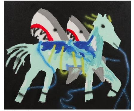
Robert Nava Shark Wing Pegasus , 2019 acrylic & grease pencil on canvas, 182.2 x 213.2 cm. Estimate: HK$1,200,000-1,800,000 / US$154,000-231,000