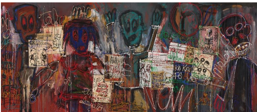
Aboudia Untitled (Take Me II) , 2011 acrylic and mixed media on canvas, diptych, 117.5 x 274 cm. Estimate: HK$500,000-700,000 / US$64,100-89,700

London-based Hungarian artist Szabolcs Bozó paints fantastical creatures that appear lifted from children's books. A self-taught artist, Bozó is part of a younger guard of artists who looks for inspiration in images made by children, and is known for his childlike large-scale paintings of animals and abstract characters.