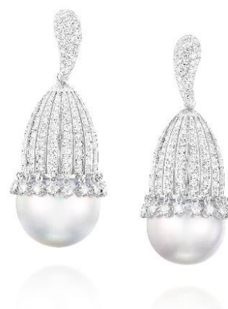
A Pair of Cultured Pearl and Diamond Earrings, Karen Suen Estimate: HK$68,000 - 88,000/ US$8,800 - 11,000