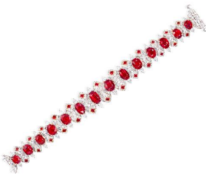
A Superb Burmese Ruby and Diamond Bracelet; Rubies weighing approximately 28.11 carats total Estimate: HK$ 2,000,000 – 2,800,000/ US$ 250,000 – 350,000