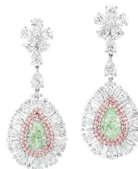
A Pair of Fancy Yellowish Green Diamond and Diamond Ear Pendants Estimate: HK$ 240,000 – 320,000/ US$ 30,000 – 40,000