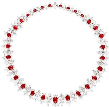
An Elegant Burmese Ruby and Diamond Necklace; Rubies weighing approximately 31.09 carats total, diamond weighing approximately 34.87 carats total HK$ 1,400,000 – 2,200,000/ US$ 180,000 – 280,000

Other highlights include a sensational and important set of Burmese fine rubies which comprise a necklace, a bracelet and a pair of ear pendants featuring various oval and cushion-shaped ‘pigeon’s blood’ rubies with scintillating diamonds. When a set of fine rubies are well-matched in tone, saturation, and quality, it creates an impressive and magnificent appearance.