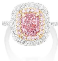
A 2.04 carat Fancy Intense Pink Diamond and Diamond Ring Estimate: HK$1,200,000 – 2,000,000/ US$150,000 – 250,000

diamonds their value generally increases with the strength and purity of the colour. Offered this season is an exquisite example of a 7.18 carat fancy vivid yellow diamond ring and a 2.04 carat fancy intense pink diamond ring, both perfect for an everyday look or special occasions.