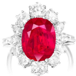
A Superb 4.95 carat Burmese Ruby and Diamond Ring Estimate: HK$3,800,000 – 4,800,000/US$490,000 – 620,000

Rubies have been adorned and coveted throughout centuries often associated with power, wealth, success, and health. In particular, the blazing red colour has been cherished in Asia as a colour of passion and luck. Highlighting this season’s sale is a selection of the finest natural rubies sourced from Burma, now Myanmar, a source of the gems since 600 A.D. and commonly regarded as the world’s most desirable origin of coloured gemstones. One of the key highlights is a ring featuring a remarkable Burmese unheated ruby weighing 4.95 carats and accentuated by various-cut diamonds. It exudes a highly saturated red colour and emanates the true glow of a fine Burmese ruby.