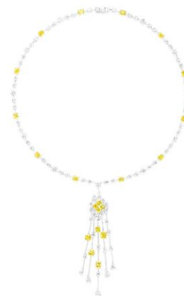
Graff, A Coloured Diamond and Diamond 'Waterfall' Pendant Necklace Estimate: HK$ 500,000 – 600,000/ US$ 65,000 – 77,000