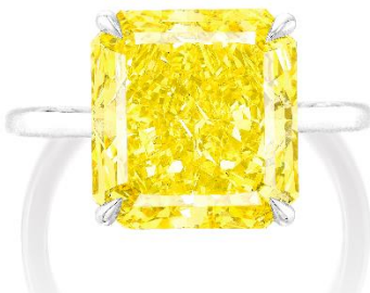
A 7.18 carat Fancy Vivid Yellow Diamond Ring Estimate: HK$1,200,000 – 2,000,000/ US$ 150,000 – 250,000