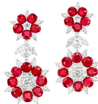
A Pair of Burmese Ruby and Diamond Ear Pendants; Rubies weighing approximately 25.49 carats total Estimate: HK$ 500,000 – 650,000/ US$ 65,000 – 85,000