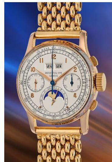
Patek Philippe ref. 1518 pink gold, silvered dial, circa 1948 Estimate: US$800,000-1,600,000

Introduced in 1941, the ref. 1518 was the first perpetual calendar chronograph wristwatch produced by any brand in series, and set the course for Patek Philippe's dominance in the world of high-end Swiss watchmaking. Scholarship suggests that Patek Philippe produced approximately 281 examples, with the majority in yellow gold, exceedingly rare examples in pink gold, and only four known examples in steel. Returning to the market after 24 years in the same important European collection, the present Patek Philippe ref. 1518 in 18K pink gold is presented in an absolutely impressive state of preservation, clearly very sparingly worn over its 76-year lifespan. Its case retains the strong lug definition, beautifully brushed, polished surfaces, and masculine appeal the reference is known for. Two strong and crisp hallmarks, one at the outer, lower edge of the lug and the second on the side of the case are perfectly defined giving further evidence to its remarkable condition. Likewise, the silver dial shows no signs of ever being restored, with only minor aging evident.