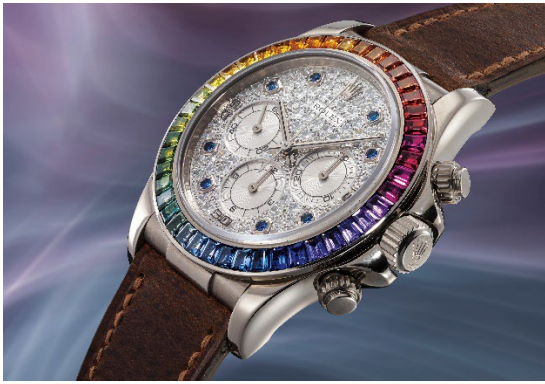
Rolex The First-Ever 'Rainbow' Daytona Ref. 16599 Circa 1994 Estimate: In excess of CHF 3 million/ US$3,540,000

innovative and complex mechanical watches ever created. This auction celebrates these achievements by showcasing unique and iconic timepieces from this remarkable period.