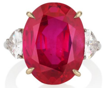
Exceptional Burmese ruby and diamond ring, weighing 17.97 carats Estimate: CHF 4,100,000 - 4,800,000 / US$4,800,000 – 5,500,000