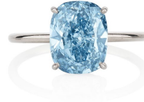
Fancy Vivid Blue diamond ring, weighing 3.24 carats, Internally Flawless, Type IIb Estimate: CHF 4,100,000 - 5,100,000/ US$4,800,000 – 6,000,000