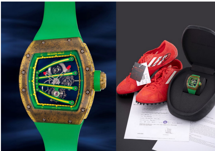
Richard Mille ref. RM59-01 Tourbillon Yohan Blake, with a pair of Yohan Blake signed running shoes Circa 2013 Estimate: HK$ 2,350,000 – 4,700,000/ US$ 300,000-600,000

this configuration that has appeared on the market.