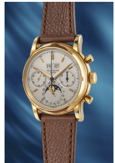
Patek Philippe ref. 2499, 18k yellow gold Circa 1980 Estimate: CHF 500,000 - 1,000,000/ US$589,000 – 1,180,000

Other highlights on view include A. Lange & Söhne's unique timepiece: the DATOGRAPH UP/DOWN "Hampton Court Edition, a vintage Rolex Cosmograph Daytona with a "Paul Newman Lemon" dial, Akrivia by Rexhep Rexhepi AK-01 tourbillon monopusher chronograph, and more.