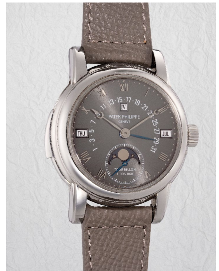
Patek Philippe Ref.5016, platinum minute repeating perpetual calendar tourbillon wristwatch Circa 1994 Estimate: HK$3,500,000 - 5,000,000/ US$450,000-650,000

Among the highlights is the Patek Philippe ref. 5016 in platinum. This wristwatch combines the tourbillon, minute repeater, and perpetual calendar within its Calatrava-style case made by Jean-Pierre Hagmann, complete with a moon phase display. Notably, the present example is accompanied by a previously unknown grey Roman numerals dial, the only known example of