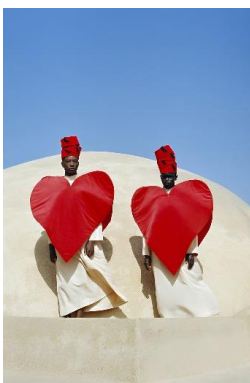
Mous Lamrabat To the Moon and Back #1, 2021 Estimate: £10,000 - 15,000