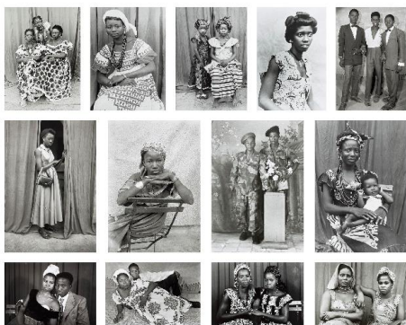
Seydou Keïta Selected Portraits , 1952 Estimate: £20,000 - 30,000

Nobuyoshi Araki's use of Polaroid photography is significant in his artistic practice. In 2015, he started creating spliced Polaroid composites due to a vision impairment. Araki cut his Polaroids in half and combined different halves to form composites. These composites, while featuring recurring subjects like nudes, and flowers, offer only partial images, blending reality and fiction. The series, titled Arakiri , is a play on the Japanese word hara-kiri , which literally translates to belly (hara) cutting (kiri), referring to the ritual of taking one's own life practiced by the samurai class in feudal Japan. In this body of work, however, it is Araki himself doing the cutting, invoking ritualistic connotations. Featuring two lots of 30 spliced Polaroids each, this sale marks the first time a substantial offering of Araki's Polaroids from this series has come to auction.