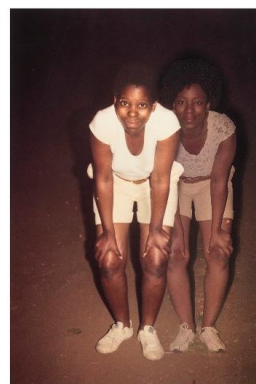
Lebohang Kganye Selected Images from Ke Lefa Laka: Her-Story, 2013 Estimate: £15,000 - 25,000