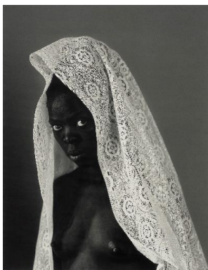
Zanele Muholi Thembeke I, New York Upstate from Somnyama Ngonyama, 2015 Estimate: £10,000 - 15,000