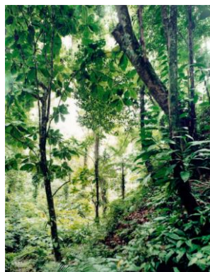
Thomas Struth Paradise 25, Yuquehy/ Brazil, 2001 Estimate: £50,000 - 70,000