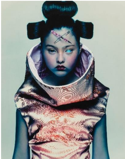
Nick Knight Devon , 1997 Estimate: £40,000 - 60,000

ULTIMATE is Led by Nick Knight's Portraits of Devon and Kate , Accompanied by Seven Auction Debuts