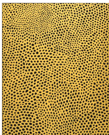
Yayoi Kusama INFINITY-NETS (GMBKA) , 2013 acrylic on canvas, 162 x 131 cm. Estimate: HK$ 12,000,000-18,000,000/ US$ 1,540,000 - 2,310,000

works by Kusama, who is often considered the most successful living female artist in the world. INFINITY-NETS (GMBKA) , 2013, is among the highlights of this season's 20th Century & Contemporary Art Hong Kong Evening Sale and a remarkable example from the artist's iconic Infinity Nets series. The series serves as a cornerstone of her artistic practice, acting as the foundation from which Kusama develops many of her sculptures and installations. Generating an entrancing optical sensation, the labyrinthine web of INFINITY-NETS (GMBKA) seems to expand and contract, coming alive as it radiates and pulsates with palpable rhythm. From afar, the repeated iterations of a single touch of the brush establish a spellbinding sense of pictorial space. Upon closer examination, the incessant quality of this calculated gesture reveals a dizzying, labour-intensive technique that envelops both the viewer and the artist in the concept of the infinite. Expanding her palette to include vibrant colours, INFINITY-NETS (GMBKA) represents a mature, archetypal work from the artist's oeuvre rendered in acrylic paint instead of oil – a pivotal transition that Kusama undertook in the late 1970s. This transition signified the artist's return to a water-based medium, which built on her foundational training in traditional Japanese painting.