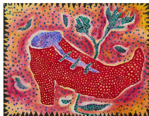
Yayoi Kusama Red Shoe , 1979 acrylic and pen on paper, 51.3 x 65.5 cm. Estimate: HK$ 3,000,000 - 5,000,000/ US$ 385,000 - 641,000

Coming to auction for the first time, Gold Accumulation (1) offered in the Evening Sale is an exquisite example of Kusama's central artistic motif – the polka dot, and has remained in an important Asian collection for more than two decades. Executed in 1999, the present work marks the apex of a period when a major retrospective of her works was shown in New York, Los Angeles and Tokyo that in all respects solidified Kusama's status and significance in the contemporary art world. Kusama's devotion to polka dots can be traced back to her childhood, when immense grasslands would blur her vision and create a sense of self-obliteration. Closely related to her celebrated Infinity Net series in its intricate, repeating, all-over pattern, Gold Accumulation (1) captures the obsessional focus on accumulation, repetition, and the infinite that best characterises the artist's internationally celebrated practice. Accumulating gold dots with variations in size create a topographical landscape of connected circles, drawing viewers into Kusama's own, definitive experience of infinity.