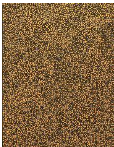
Yayoi Kusama Gold Accumulation (1) , 1999 acrylic on canvas, 117 x 91 cm. Estimate: HK$ 8,000,000 - 12,000,000/ US$ 1,030,000 - 1,540,000