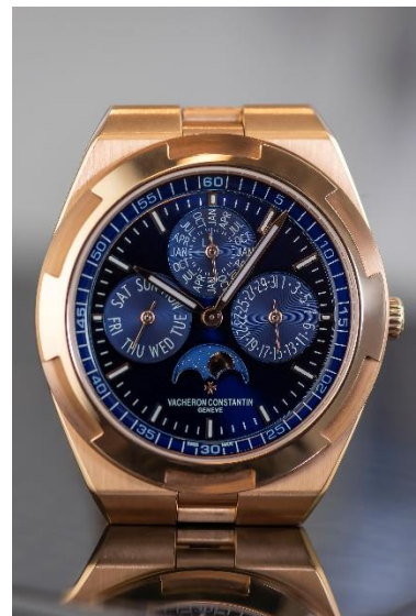
Vacheron Constantin Overseas ref. 4300V/120R-B509, Circa 2022

Phillips' team of dedicated specialists will curate the Perpetual offering in Hong Kong with meticulous attention to detail, ensuring that each piece is a testament to the platform's commitment to quality and distinction. Phillips Perpetual Hong Kong will continue to expand its online presence, with future plans for integrating "Buy Now" capabilities, adding a new dimension of convenience for direct online purchases.