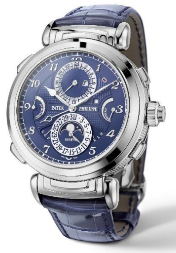
Patek Philippe The Grandmaster Chime ref. 6300G-010, Circa 2022

Phillips is delighted to present an esteemed Patek Philippe collection at the Phillips Perpetual boutique. Leading the collection is the Grandmaster Chime reference 6300G-010 in white gold with two blue opaline dials, one that focuses on the time of day, the other dedicated to the full instantaneous perpetual calendar. The Grandmaster Chime is the most complicated wristwatch ever made by Patek Philippe. The development, production and assembly process of the watch covered a staggering 100,000 hours.