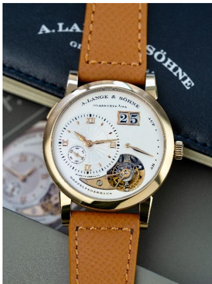
A. Lange & Söhne Lange 1 Tourbillon ref. 722.050, Circa 2010