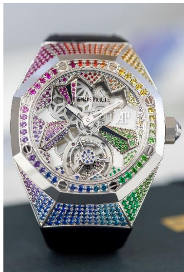
Audemars Piguet Royal Oak Concept 'Rainbow' Flying Tourbillon ref. 26227BC.YY.D326CR.01-A, Circa 2022

1120 QP, based on the historical calibre 1121 which powered the Vacheron Constantin 222, and boasts an additional perpetual calendar module.