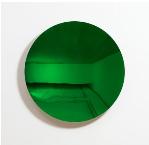
Anish Kapoor, Untitled , 2011 Sold for $469,900