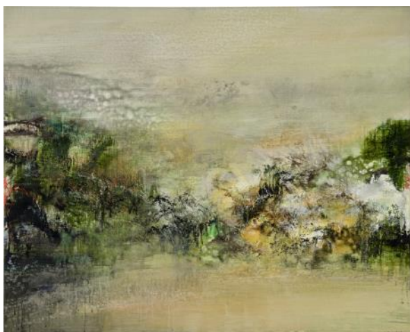
Zao Wou-Ki 25.11.81 , 1981 oil on canvas, 81.2 x 100 cm. Estimate: HK$7,000,000 — 10,000,000/ US$897,000 - 1,280,000 (To be offered in the Day Sale on 1 June)