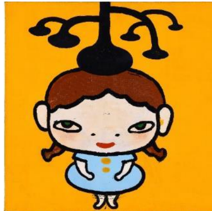
Yoshitomo Nara O.T (N.G) , 1993

(To be offered in the Day Sale on 1 June)