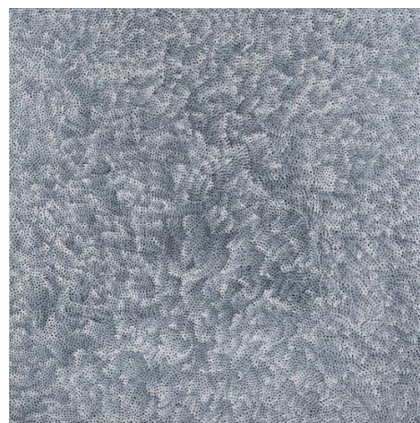
Yayoi Kusama INFINITY NETS (ZGHEB) , 2007 acrylic on canvas, 194 x 194 cm. Estimate: HK$20,000,000-30,000,000/ US$2,560,000-3,850,000 (To be offered in the Evening Sale on 31 May)

The Day Sale on 1 June will be led by Zao Wou-Ki's 25.11.81 which stands as an arresting and mesmerising archetype of the artist's celebrated corpus of monumental abstract landscapes. Remaining in the same private collection since its execution in 1981, a significant year for Zao's artistic career when he received his first major retrospective in France at the Galeries Nationales du Grand Palais. Focusing on the interplay of light and space, the present painting deviates from the explosive energy of the artist's Hurricane Period and demonstrates his arrival at a more tranquil and sublime view of the universe. Suggestive of Zao's own self-awareness, 25.11.81 presents a