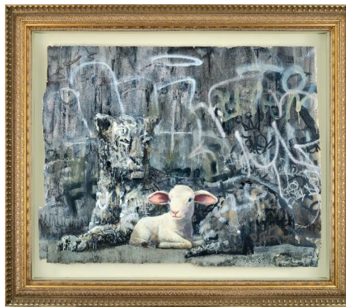
Banksy The Leopard and Lamb, 2016 acrylic on ply, in artist's frame, 148 x 172 cm. Estimate: HK$18,000,000-28,000,000/ US$ 2,310,000-3,590,000

(To be offered in the Evening Sale on 31 May)