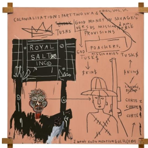
Jean-Michel Basquiat Natives Carrying Some Guns, Bibles, Amorites on Safari, 1982 acrylic and oil stick on canvas on wood supports, 183.2 x 182.2 cm. Estimate: HK$90,000,000-$120,000,000/ US$11,540,000-15,380,000 (To be offered in the Evening Sale on 31 May)