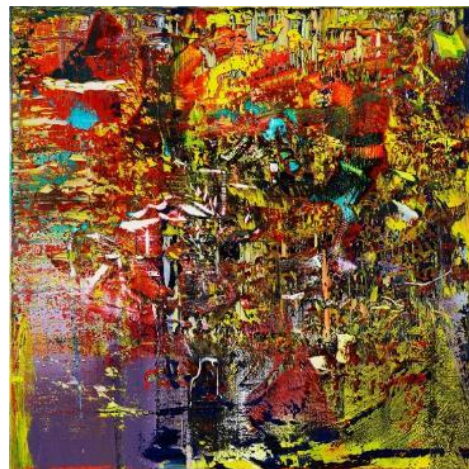
Gerhard Richter Abstraktes Bild (947-5) , 2016 oil on canvas, 70 x 70 cm. Estimate: HK$26,000,000-36,000,000/ US$ 3,330,000-4,620,000 (To be offered in the Evening Sale on 31 May)

Yayoi Kusama 's iconic Net paintings have continually captivated audiences with their breathtaking aesthetics, intriguing psychological depths, and profound philosophical undertones. Offered in the Evening Sale, INFINITY NETS (ZGHEB) from 2007, envelops viewers within a sea of turbulent grey misty swirls, serving as a remarkable testament to Kusama's skillful manipulation of touch, rhythm, and depth, infusing her art with renewed vitality. In the present lot, Kusama expands beyond her earlier monochromatic approach and incorporates more subtle tonal gradations and spatial senses. It is among a more contemporary corpus that propels the ceaseless expansion of the Kusama universe to new heights. In May 2022, Phillips sold Kusama's earliest corpus of Net paintings, Untitled , 1959, for a record-breaking price of US$ 10.5 million.