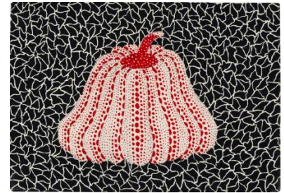
Yayoi Kusama Pumpkin , 1982

Yoshitomo Nara's O.T (N.G) features the iconic Nara girl wearing a baby blue Alice in Wonderland style dress, the same as in three of the artist's top ten results at auction. The painting assembles some of the most desirable Nara girl traits: a full body portrait, almond shaped downturned eyes, a non-descript background of colour built up from numerous layers of paint. The girl wearing a black crown that looks like sprouting seeds, which echoed the motif that Nara has explored numerous times throughout his oeuvre, bringing to mind themes such as progress, evolving, the natural world and rebirth.