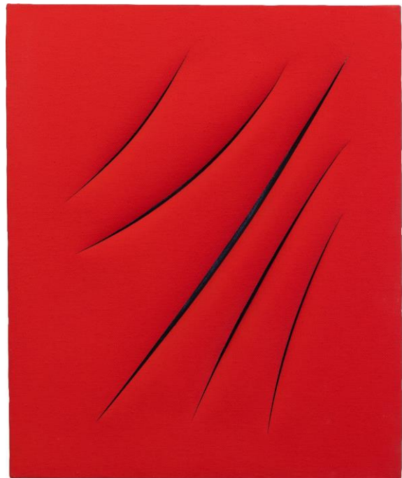
Lucio Fontana Concetto spaziale, Attese, 1964