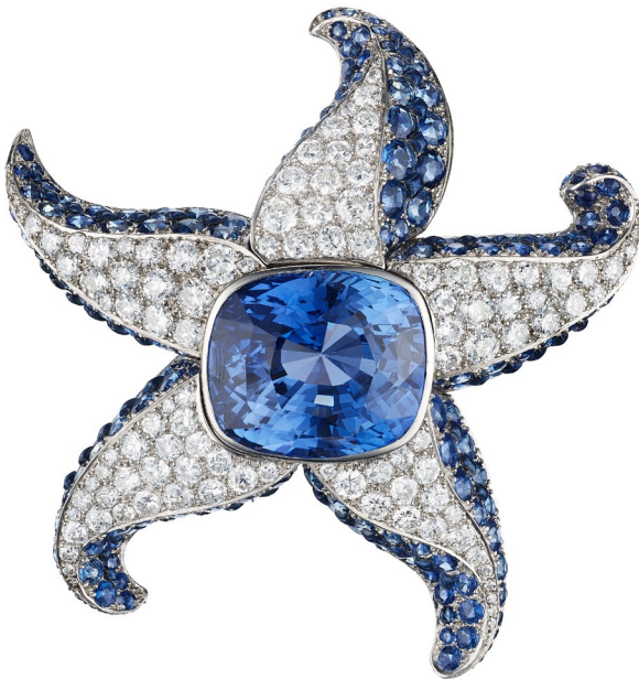
René Boivin Magnificent Art Deco Sapphire and Diamond Brooch 'Starfish', 1938 Sold for $571,500