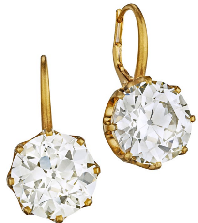
Lot 24 Pair of Diamond Earrings Sold for $279,400