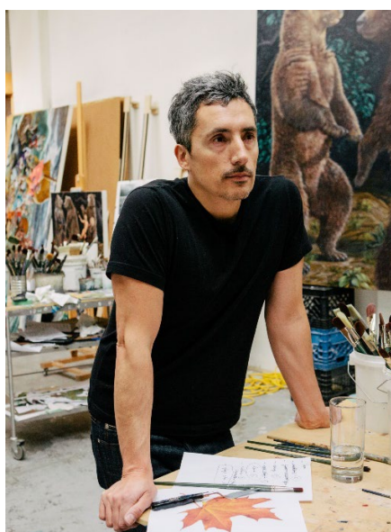
Kent Monkman