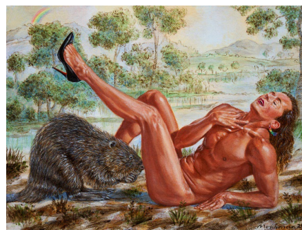
Study for amiskiss , 2024 Acrylic on panel 9 x 12in

Click here for more information: https://dropshop.phillips.com/