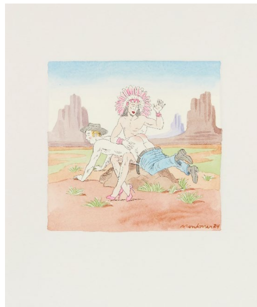
How the West Was Won, 2024 Copper plate etching with Watercolor on Acid-Free Paper, Edition of 30 Sheet Size: 11 x 9.25in Image Size: 6 x 6in

Kent Monkman is an interdisciplinary Cree visual artist. A member of Fisher River Cree Nation in Treaty 5 Territory (Manitoba), he lives and works between New York City and Toronto. Monkman's gender-fluid alter ego Miss Chief Eagle Testickle often appears in his work as a