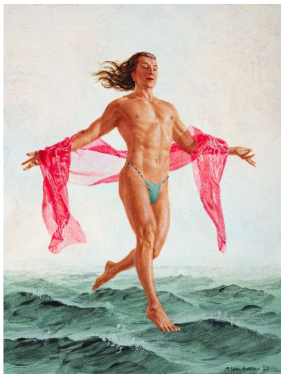
Study for I Am Water , 2023 Acrylic on panel 12 x 9in