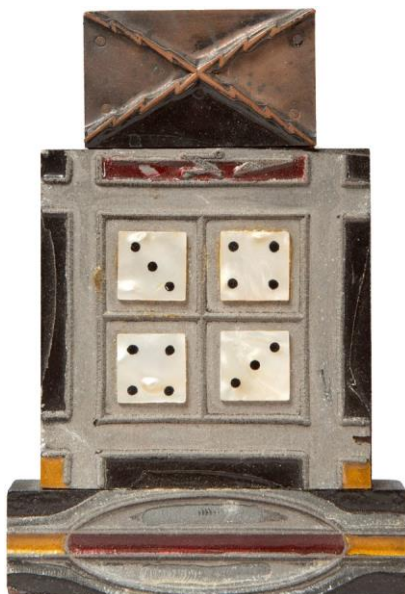
Betye Saar Things Left Unsaid , 1979 5.25 x 4.5 x 1 in.