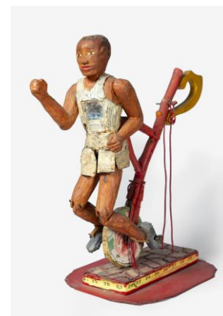
Alison Saar Jesse Owens 1936, 1985 17 x 16 x 8 in.