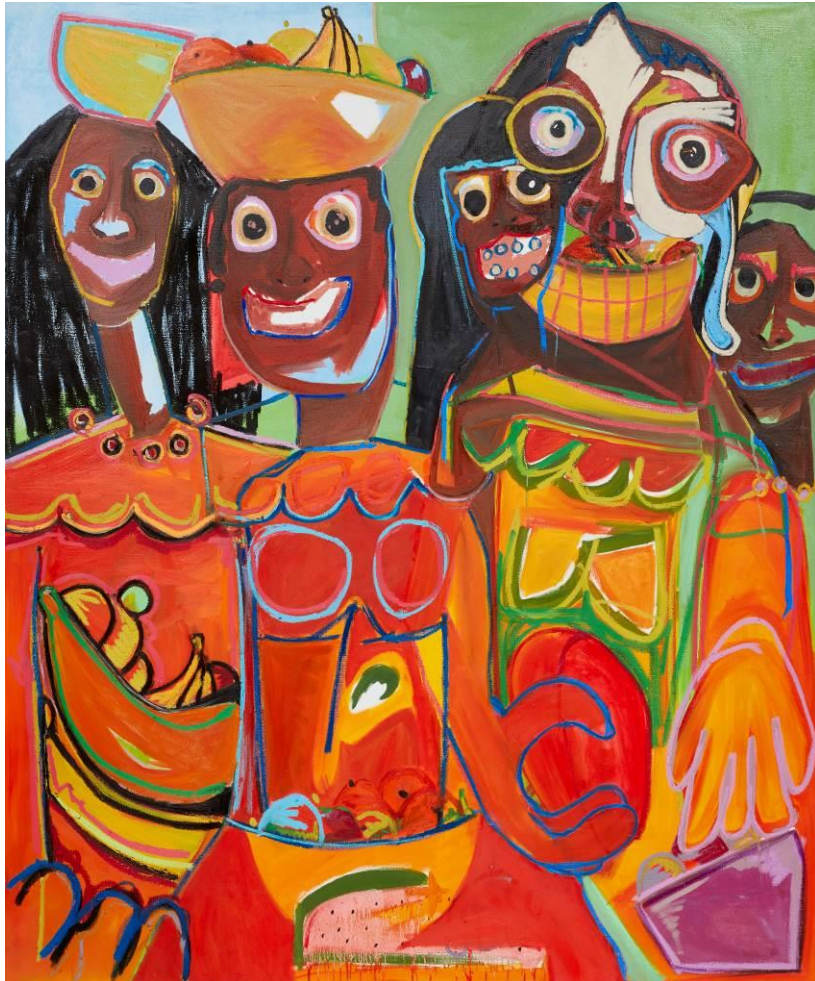
Milo Matthieu Los Siete Infantes , 2021 Estimate: $15,000-20,000

Auction House to Build Functioning Basketball Court at 432 Park Ave, in Conjunction with Charity Sale on 28 September