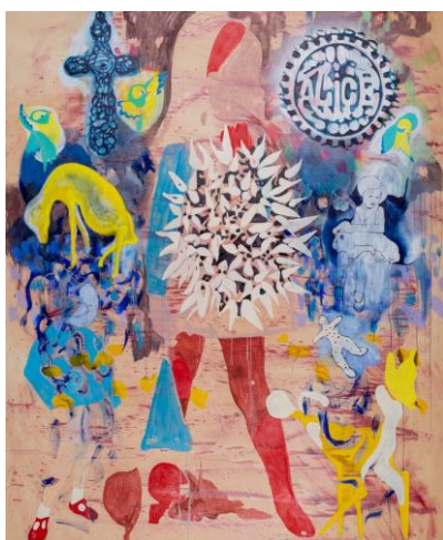
Alexis Soul-Gray Happy Birthday Alice, 2024