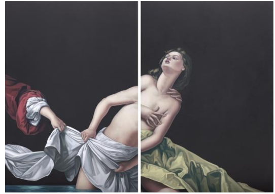
Jesse Mockrin A Cymbal Crashed and Roaring Horns , 2017 Estimate £60,000 - 80,000