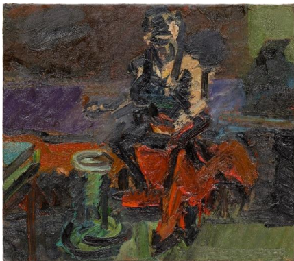
Frank Auerbach J.Y.M. Seated in the Studio II , 1987-88 Estimate £600,000 - 800,000