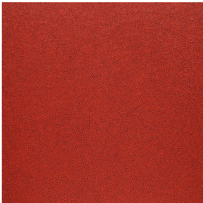
Yayoi Kusama INFINITY-NETS (ZXSSAO) , 2008 Estimate £1,800,000 - 2,500,000