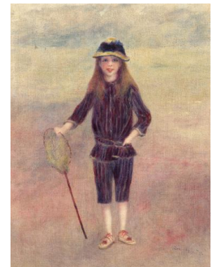
Pierre-Auguste Renoir La petite pêcheuse , 1879 Estimate £900,000 - 1,200,000