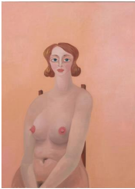
George Condo Irish Girl , 2002 Estimate £320,000 - 500,000

George Condo's Irish Girl epitomises his exploration of portraiture, seamlessly blending diverse styles like Cubism, Neo-Classicism, Surrealism, and Pop Art. Painted in 2002, it stands out among his works for its elegance and depth, balancing refinement with complexity. Unlike many of his other portraits, which often evoke a mix of horror and beauty with distorted facial features, Irish Girl invites viewers to contemplate human psychology through its nuanced portrayal. With this piece, Condo solidifies his reputation as a visionary artist pushing the limits of contemporary painting.