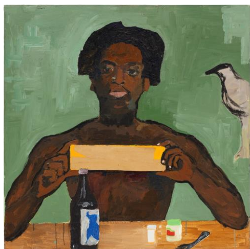
Henry Taylor Government Cheese , 2003 Estimate: $100,000-150,000