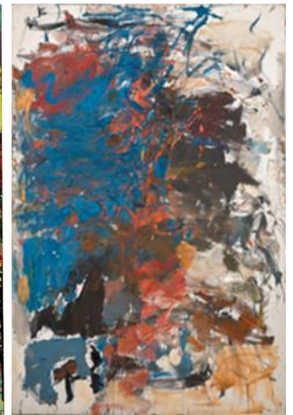
Joan Mitchell Blueberry , c. 1962 Estimate: $9,000,000-12,000,000

NEW YORK – 31 OCTOBER 2023 – Phillips is pleased to announce highlights from the New York Evening Sale of 20th Century & Contemporary Art, with the full sale now available online . Taking place on 14 November, directly following the highly anticipated dedicated auction, Living the Avant-Garde: Works from The Triton Collection Foundation , the seasonal Evening Sale will feature a remarkable selection of thirty works by artists spanning the Modern, Post-War, and Contemporary movements, including Gerhard Richter, Georg Baselitz, Joan Mitchell, Pablo Picasso, and Henry Taylor. The exhibition at 432 Park Avenue will be open to the public from 4-14 November in the lead-up to the auction.