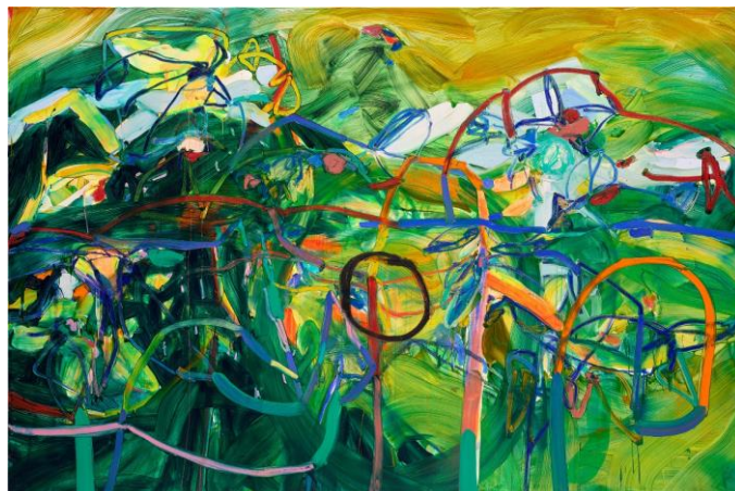
Jadé Fadojutimi Quirk my mannerism , 2021 Estimate: $600,000-800,000