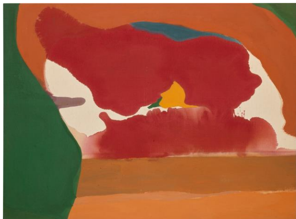
Helen Frankenthaler Fire , c. 1964 Estimate: $2,000,000-3,000,000

In a strategy long-embraced by Phillips, works by artists creating today will also be included in the sale, alongside these Modern and Post-War masters. Among such works are Ambera Wellmann's Ritz , Lucy Bull's Dark companion , Jadé Fadojutimi's Quirk my mannerism , and Henry Taylor's Government Cheese , the sale of which coincides with Taylor's widely acclaimed solo exhibition at the Whitney Museum of American Art, New York (which traveled from the Museum of Contemporary Art, Los Angeles). Painted in 2003 and based on his brother's mugshot, Government Cheese was prominently featured in Taylor's first museum solo exhibition at The Studio Museum, Harlem, in 2007.