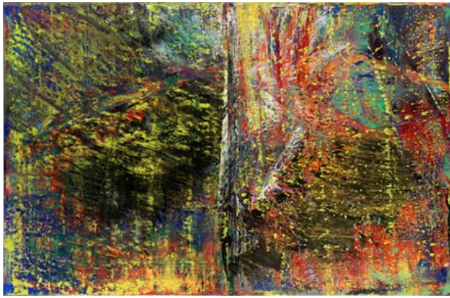
Gerhard Richter Abstraktes Bild , 1987 Estimate Available Upon Request

Leading the auction is Gerhard Richter's exceptional Abstraktes Bild , announced earlier this season. Painted in 1987, the work is over thirteen feet wide and nearly nine feet tall, making this one of the largest works from Richter's oeuvre to ever be offered at auction. With Richter's unique use of the squeegee, a tool he began using for abstract work just one year prior, the artwork captures the movement of the artist's body through the painting process, and expands his wider philosophy of artistic creation as a vital and hopeful act. Besides the present work, there is only one other Abstraktes Bild created in 1987, of similarly epic scale, which resides in the Museu Coleção Berardo, Lisbon.