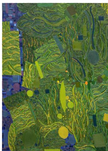
Lynne Drexler Seasonal Green , 1969 Estimate: $300,000-500,000