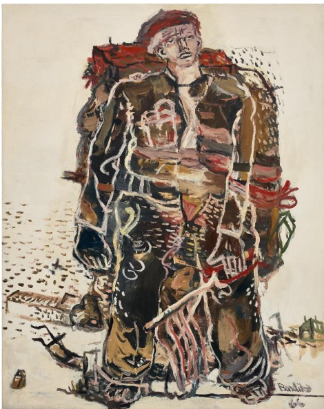
Georg Baselitz Ein Roter , 1966 Estimate: $6,000,000-8,000,000

Self-portrait and icon at once, Georg Baselitz's Ein Roter , will also be featured in the Evening Sale. The work is a masterpiece from the artist's Hero series, and was painted in his West Berlin studio in 1966. Taking on the visual tropes of academic history painting, and the Romantic landscapes of Caspar David Friedrich, Ein Roter presents a hero for the Post-War era: an ambivalent figure devoid of national pride. The work's inclusion in a 1968 exhibition of Baselitz's work is markedly early for a Hero painting—the group was not shown comprehensively until 1973—suggesting that the artist held this painting in esteem as representative of the series.