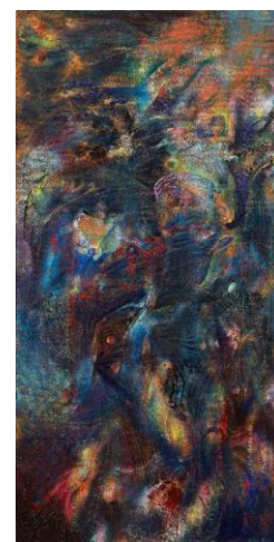
Lucy Bull Dark companion , 2020 Estimate: $400,000-600,000