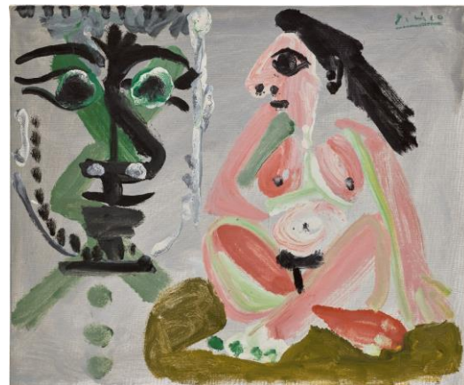
Pablo Picasso Tête d'homme et nu assis , 1964 Estimate: $1,800,000-2,500,000

Pablo Picasso's Tête d'homme et nu assis is exemplary of many of the pictorial and thematic concerns that characterized the artist's late career. The work is one of the final variations on a subject that preoccupied the artist in the autumn of 1964 – Jacqueline Roque, his last love and muse. Executed the same day as a similar painting now held in Princeton University Art Museum, the present work shows Picasso contemplating his role as both a painter and lover.