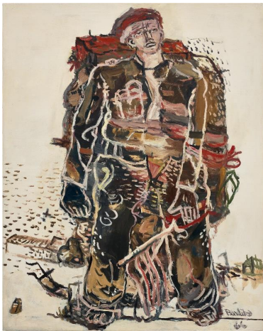
Georg Baselitz Ein Roter , 1966 Estimate: $6,000,000-8,000,000