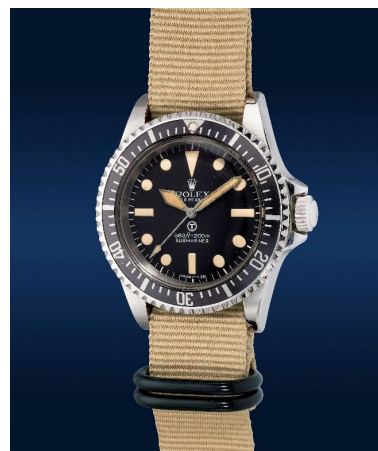
Rolex, Submariner "MilSub", ref. 5517 in stainless steel, Circa 1978 Estimate: HK$ 1,950,000 - 3,900,000/ US$ 250,000-500,000