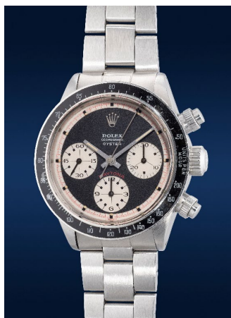
Rolex, Cosmograph Daytona, "Paul Newman Oyster Sotto", ref. 6263 in stainless steel, Circa 1969 Estimate: HK$3,500,000 - 5,500,000/ US$450,000-700,000

The Rolex Submariner Milsub is by far one of the most elusive and coveted models amongst the vintage realm of Rolex timepieces. The present example was uniquely made for the British Ministry of Defense (MOD) in 1978 and without doubt the most prized and sought after of all Rolex Milsubs. Well-preserved with crisp reference numbers engraved between the lugs and on the caseback, the "Maxi-dial" has aged with an attractive patina on the large luminous plots and sword hands. Fresh-to-the-market, this impressive relic was in possession of a discerned collector for over 12 years. A rare opportunity to own one of the most prized vintage timepieces that rarely appear at auction, this is an exciting chance for all Milsubs fans.