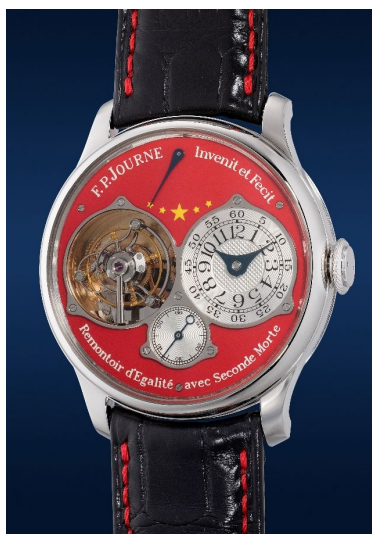
F.P. Journe, Tourbillon Souverain "China 2010", Circa 2010 Estimate: HK$6,000,000 - 10,000,000/ US$770,000-1,280,000