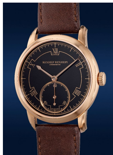
Rexhep Rexhepi, Chronomètre Contemporain, Circa 2019 Estimate: HK$1,600,000 - 3,000,000/ US$200,000-385,000