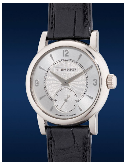
Philippe Dufour, Simplicity, Circa 2001 Estimate: HK$2,000,000 - 4,000,000/ US$256,000-510,000