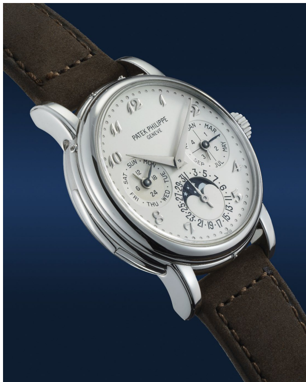
Patek Philippe, Ref. 3974P-001 in platinum, Circa 2001 Estimate: HK$8,800,000 - 17,600,000/ US$1,100,000–2,200,000

A Complete Set of Five F.P. Journe Stainless Steel Wristwatches Offered by the Original Owner to Appear at Auction for the First Time