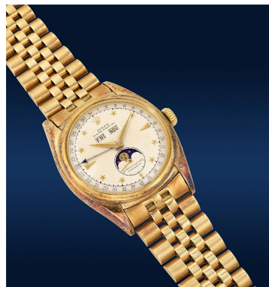
Rolex, 'Stelline' ref. 6062 in yellow gold, Circa 1952 Estimate: HK$ 5,500,000 - 11,000,000/ US$700,000-1,400,000

Launched at the Basel fair in 1950, ref. 6062 was the first automatic wristwatch with date and moon phase housed in a waterproof case. The model was fitted with a number of dial variants and the most desirable version is one fitted with eight faceted stars in lieu of hour numerals, that collectors have dubbed it ‘Stelline’, meaning 'starlet' in Italian. The 'Stelline' presented in this season’s Hong Kong sale is one of the most beautiful examples of the reference which preserved in incredible condition. It was previously sold at Rolex Milestones: 38 Legendary Watches That Shaped History held by Phillips Hong Kong in 2016. There is light tarnishing in the form of patina, which gives this watch so much character and history, furthermore attesting to its untouched condition. The Super Oyster crown is original, as is the Jubilee bracelet, stamped for the third quarter of 1952.