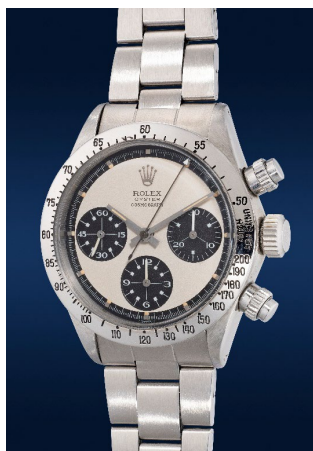
Rolex, Oyster Cosmograph "Paul Newman", ref. 6265 in stainless steel, Circa 1971 Estimate: HK$2,750,000 - 4,300,000/ US$350,000-550,000