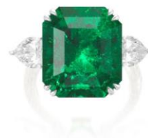
A 13.17-carat Colombian No-Oil Emerald and Diamond Ring Estimate: HK$3,900,000 – 4,800,000/ US$500,000 – 620,000