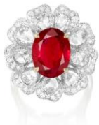
A 4.00-carat Burmese Unheated Ruby and Diamond Ring Estimate: HK$2,500,000 – 3,500,000/ US$320,000 – 450,000

The finest Colombian emeralds exhibit a richly saturated and homogeneous bluish green hue, and often possess a variety of internal inclusions, or fingerprints of nature, due to the delicate balance of their formation and the demanding methods taken to obtain these precious gems. Untreated examples with high clarity are thus extremely rare and sought after. This season, Phillips presents a spectacular 13.17-carat Colombian emerald and diamond ring, free from oil treatment, with a highly desirable intense colour and a well-proportioned cut.