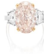
A 5.41-carat Fancy Orangy Pink Diamond and Diamond Ring

Estimate: HK$3,300,000 – 4,400,000/ US$425,000 – 560,000