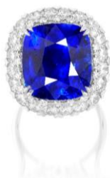
A 22.15-carat Burmese Unheated Sapphire and Diamond Ring Estimate: HK$3,000,000 – 4,000,000/ US$385,000 – 520,000

Burma has been home to the world's finest rubies and sapphires since ancient times, and its sapphires are particularly known for their superb, rich and vibrant blue hue. Modern Burmese mines yield very few sapphires of gem-quality, even fewer of which exceeds 10 carats after cutting and polishing. Offered in this season's sale is an exceptional sapphire that is free from any heat treatment weighs more than 20 carats which is surely the dream of gemstone collectors. Another revered pedigree of sapphires is Kashmir. Since their discovery, Kashmir sapphires have acquired a legendary status for their unmatched rich blue hue and velvet texture. Kashmir sapphires constitute a minuscule percentage of the globe's total sapphire supply. Thus, finding an example is a truly unusual stroke of good fortune, such as the present lot, an unheated gem quality Kashmir surpassing five carats.