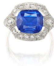
A 5.39-carat Kashmir Unheated Sapphire and Diamond Ring Estimate: HK$1,900,000 – 2,800,000/ US$240,000 – 360,000