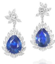
A Pair of Burmese Unheated Sapphire and Diamond Ear Pendants, sapphires weighing 39.68 carats in total Estimate: HK$1,750,000 – 2,500,000/ US$220,000 – 320,000