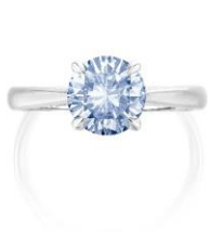
A 1.63-carat Fancy Intense Blue Diamond Ring

Also on offer is a 5.41-carat fancy orangy pink diamond and diamond ring. In the past decade, the popularity of pink diamonds has soared phenomenally due to its enigmatic charm, even more so when the Argyle Mine in western Australia, which produced over 90% of the world's pink diamonds, announced its closure in end of 2020. Now that there is no discovery of new mines, or any comparable ones in existence, it is only logical that the prices of pink diamonds continue to increase. Fancy pink diamonds of over 2 carats are highly collectible, and a specimen like the present lot which weighs more than 5 carats is the ultimate dream of any collector.