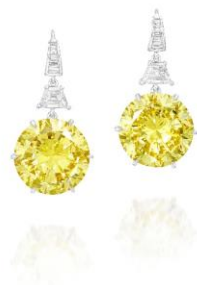
A Pair of 9.69- and 9.71-carat Fancy Intense Yellow Diamond and Diamond Earrings

Estimate: HK$ 9,500,000 – 12,500,000/ US$ 1,220,000-1,600,000