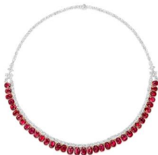
A Burmese Unheated Ruby and Diamond Necklace, rubies weighing 40.35 carats in total Estimate: HK$1,400,000 – 2,000,000/ US$180,000 – 260,000