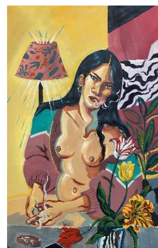
Giorgio Celin Figure with Flowers, 2021