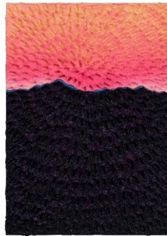
Jennifer Guidi Light on the Mountain(...) , 2020 Estimate: £20,000 - 30,000