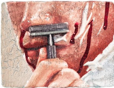
Joseph Yaeger In helpless longing to get close you must destroy what's close , 2020 Estimate: £10,000 - 15,000