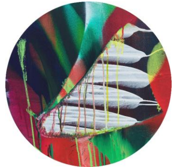
Katharina Grosse Untitled , 2017 Estimate: £40,000 - 60,000