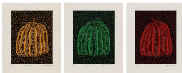
Yayoi Kusama Pumpkin (YT) ; Pumpkin (GT) and Pumpkin (RT) , 1996 Estimate: HK$550,000-650,000/ US$70,500-83,300