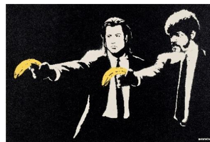
Banksy Pulp Fiction , 2004 Estimate: HK$150,000-200,000/ US$19,200-25,600

Another standout work is David Hockney's My Window: No. 778, 17th April 2011 , offering a captivating glimpse outside the window of the artist's Yorkshire home on a specific day. Grapes by Andy Warhol is a rare trial proof and exemplifies his signature Pop Art style, transforming everyday objects into vibrant and striking works of art.