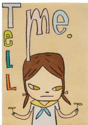
Yoshitomo Nara Tell Me , 2014 Estimate: HK$220,000-320,000/ US$28,300- 41,200

Also highlighted in the auction will be Yoshitomo Nara's Tell Me which depicts the iconic 'Nara girl' with almond shaped eyes and mischievous smile that has captivated audiences worldwide. The sale will also feature a rare set of Yayoi Kusama's three works Pumpkin (YT) ; Pumpkin (GT) and Pumpkin (RT) , showcasing the artist's most recognisable motifs of pumpkin and infinity nets. Further highlights include Banksy's Pulp Fiction depicting an iconic scene from the 1994 film of the same name, which was originally stenciled in London's Old Street tube station.