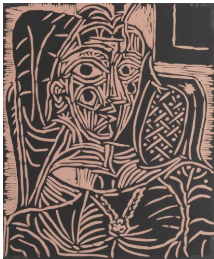
Pablo Picasso Portrait de Jacqueline au Fauteuil , 1958 Estimate: HK$300,000-400,000/US$38,500-51,300

Leading the inaugural sale is Damien Hirst's The Virtues (H. 9) (illustrated on page 1), a work inspired by Bushidō, the Japanese Samurai code of ethics. Rich with art historical references—from Van Gogh to Abstract Expressionism—Hirst's work captures the delicate beauty of Japanese cherry blossoms and the profound sincerity and discipline of Bushidō.