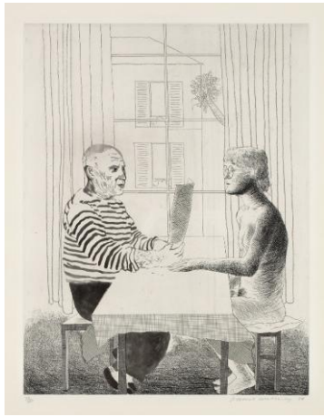
David Hockney Artist and Model, 1974 On Loan from a Private Collection