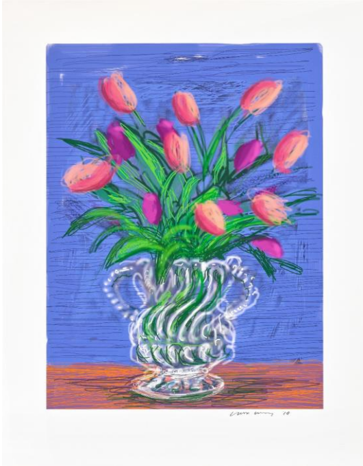
David Hockney A Bigger Book. Art Edition No. 251–500 'Untitled, 346', 2010/2016 Estimate: £15,000 – 20,000 Phillips' David Hockney Auction

A Special Showcase of Hockney's Iconic Works On View at Phillips in Paris from 7 to 18 April