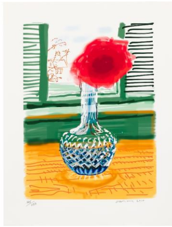
David Hockney My Window. Art Edition (No. 251–500) 'No. 281': 23rd July 2010, 2010/2019 Estimate: £12,000 – 18,000 Phillips' David Hockney Auction