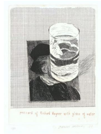
David Hockney Postcard of Richard Wagner, 1973 Estimate: £2,500 – 3,500 Phillips' David Hockney Auction

Exhibition viewing: 7–11 April, 10am–6pm, 14–18 April, by appointment