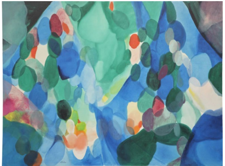
Alice Baber The Axe in the Grove , 1966 48 x 64 inches

This timely selling exhibition coincides with the publication of Gail Levin's authoritative new biography, Alice Baber: An Artist's Triumph Over Tragedy —a major scholarly reassessment that traces Baber's journey from the 1950s New York art scene and the transatlantic Paris milieu to her role in key feminist exhibitions of the 1970s and her global travels as a U.S. State Department cultural emissary. Simultaneously, the show aligns with the museum exhibition "Exploring the Collection: Alice Baber" at the Art Museum of Greater Lafayette in Indiana, where Baber studied and where a significant trove of her work is held, underscoring a broader institutional and scholarly momentum restoring her place within the postwar American canon.