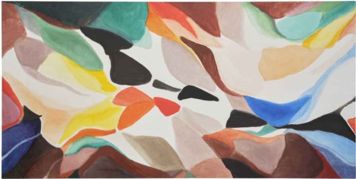
Alice Baber The Jaguar Drum Leaps to Daylight , 1978 36 x 72 inches

Click here for more information: https://exhibitions.phillips.com/collections/alice-baber