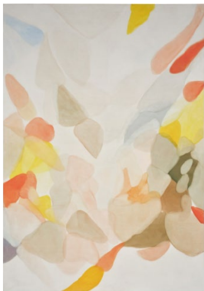
Alice Baber Swirls of Sounds-Wind, Rock and Sun , 1975 103 x 71 3/4 inches