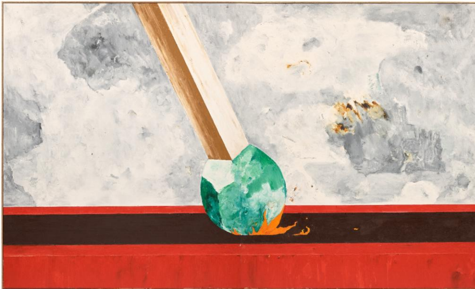
Harold Ancart Untitled , 2019 Estimate: $200,000 – 300,000