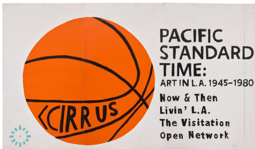
Jonas Wood Untitled (Pacific Standard Time) , 2011 Estimate: $150,000 – 200,000