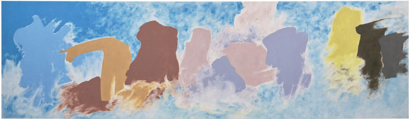
Friedel Dzubas Mira Monte , 1977 Estimate: $80,000 – 120,000