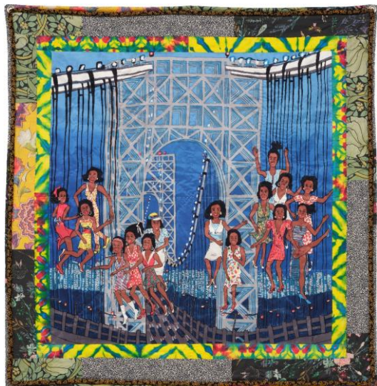
Faith Ringgold Dancing on the George Washington Bridge II , 2021 Estimate: $100,000 – 150,000