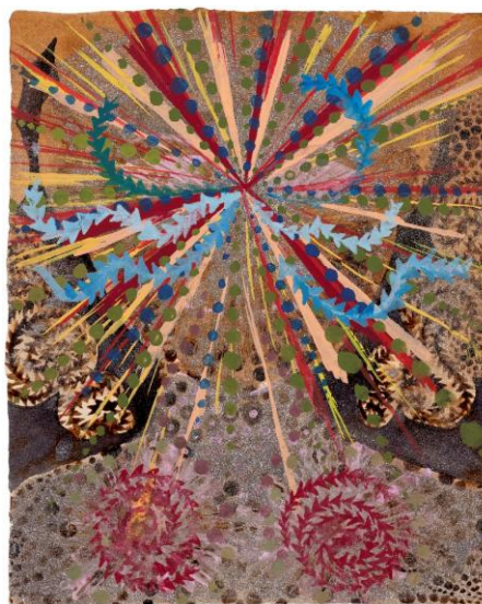
Firelei Báez Memory Like Fire , 2015 Estimate: $15,000 – 20,000