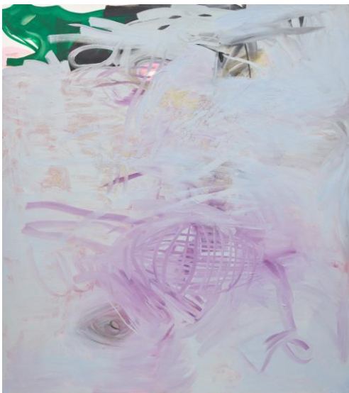
Charline von Heyl Untitled , 1999 Estimate: $150,000 – 200,000