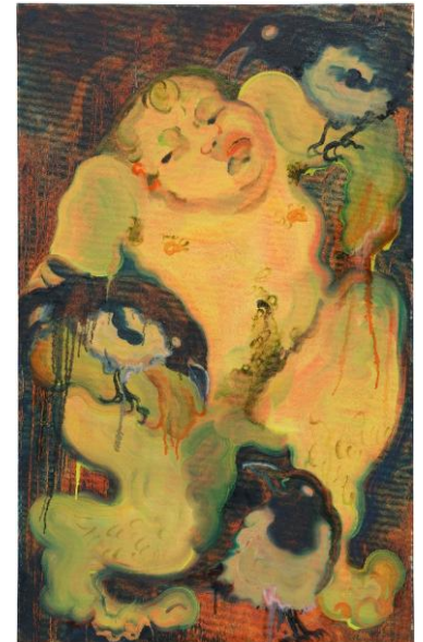
Georg Wilson Three for a Wedding , 2021 Estimate: $6,000 – 8,000