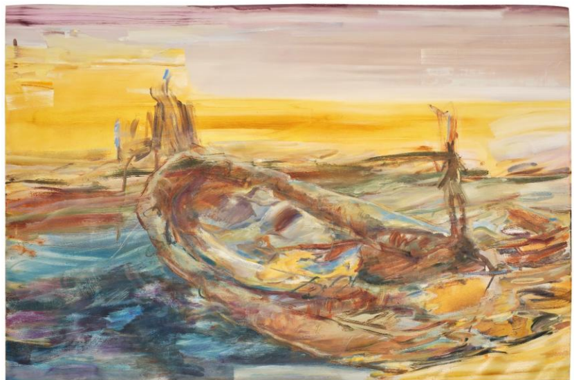
Kylie Manning Weltschmerz , 2020 Estimate : $30,000 – 50,000