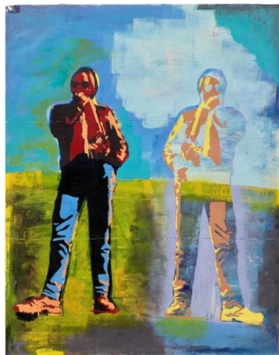
Sarah Lucas The Last Crusade I , 1993 Estimate: $100,000 – 150,000 Hoarder VI: The Migration