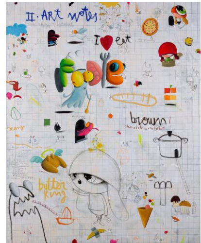
Edgar Plans Art Notes II , 2025 Summer on Park 2025

NEW YORK – 9 JULY 2025 – Phillips is pleased to present Summer on Park, an annual series of exhibitions, auctions, and Dropshop releases that celebrate the summer in the city at Phillips' New York headquarters on 432 Park Avenue.