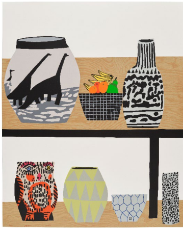
Jonas Wood Shelf Still Life , 2018 Estimate: $8,000 – 12,000 To be offered in the Online Auction