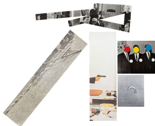
John Baldessari The Fallen Easel , 1988 Estimate $8,000 – 12,000 To be offered in the Online Auction