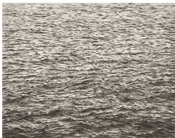
Vija Celmins Drypoint - Ocean Surface (Second State) , 1985 Estimate: $15,000 – 25,000 To be Offered in the Live Auction