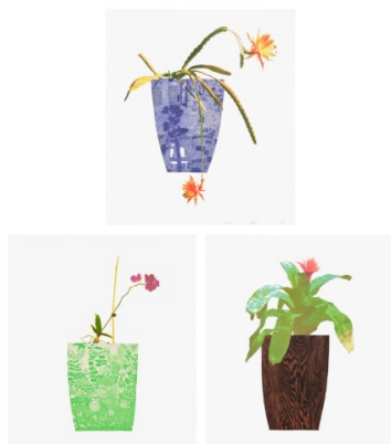
Jonas Wood Three Landscape Pots , 2019 Estimate: $20,000 – 30,000 To be offered in the Live Auction