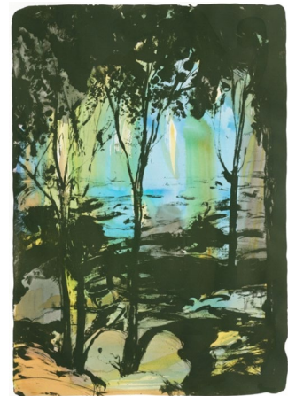
Emma Webster La Nouvelle Epoque (The New Era) , 2021 Estimate: $2,000 – 3,000 To be offered in the Online Auction