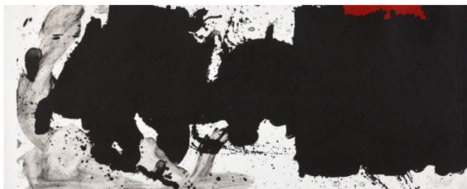
Robert Motherwell Black with No Way Out, from El Negro (T. 434, E. & B. 313) , 1983 Estimate: $12,000 – 18,000 To be offered in the Live Auction