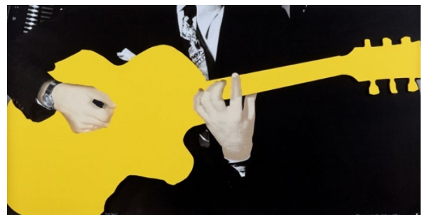
John Baldessari Person with Guitar (Yellow) (G. 2027, H. 149) , 2005 Estimate: $10,000 – 15,000 To be offered in the Live Auction

Live Auction: 7 February | Click here for more information. Online Auction: 2-10 February | Click here for more information. Auction viewing: 2-7 February Location: 432 Park Avenue, New York, NY 10022