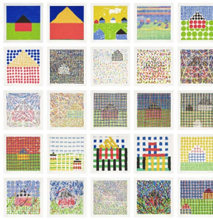
Jennifer Bartlett House , 2003 Estimate: $15,000 – 25,000 To be offered in the Live Auction