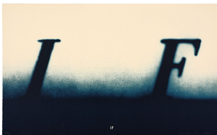
Ed Ruscha IF , 2000 Estimate: $15,000 – 20,000 To be Offered in the Online Auction