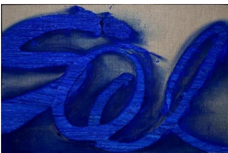
Praween Piangchoompu Beyond Remembrance , 2025 Collage with cotton, paper and acrylic on canvas, 83 x 123 cm. Estimate: HK$50,000 - 70,000/ US$6,400 - 9,000