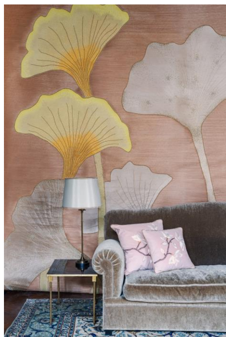
LALA CURIO's Ginkgo collection to be displayed at the New Now pre-sale exhibition

ebonised oak, gilded wood, patinated brass, table 75 x 247 x 94.5 cm, each chair 80 x 47 x 50 cm. Estimate: HK$ 150,000 - 200,000/ US$19,200 - 25,600