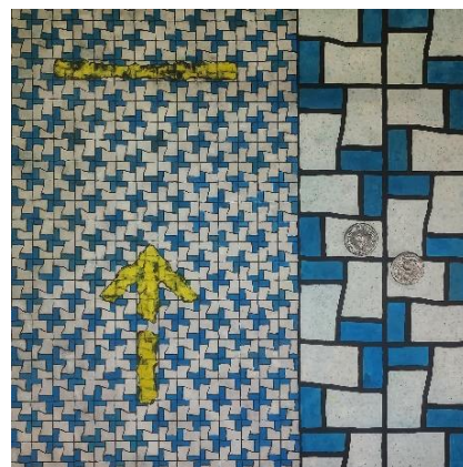
Justin Lee The Yellow Line , 2023/2024 acrylic on canvas, 150 x 150 cm. Estimate: HK$50,000 - 70,000/ US$6,400 - 9,000