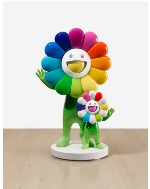
Takashi Murakami Together with the Flower Parent and Child , 2021-2022 Sold for $762,000