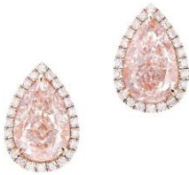
5.01-carat Very Light Pink Diamond, 5.00-carat Faint Pink Diamond and Diamond Earrings Estimate: HK$3,500,000 - 5,000,000/ US$450,000 - 640,000

This season's sale also shines with an array of dazzling coloured diamonds that will captivate collectors. Among the highlights are the exquisite 5.01-carat very light pink diamond and 5.00-carat faint pink diamond earrings, a unique asscher-cut 5.51-carat fancy vivid yellow diamond and diamond ring, and the stunning 6.49 and 6.10-carat fancy intense yellow diamond and diamond ear pendants. These exceptional pieces showcase the unparalleled beauty and rarity that make coloured diamonds so highly coveted. Coloured diamonds are highly sought after by collectors due to their rarity and unique palette. Each colour tells a different story, with pink diamonds exuding a romantic allure and yellow diamonds symbolising warmth and optimism. The exceptional colour saturation and brilliance of these gems make them standout investments and cherished additions to any collection.