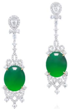
Pair of Jadeite and Diamond Ear Pendants Estimate: HK$380,000 - 650,000/ US$50,000 - 83,000

The upcoming Hong Kong sale also features timeless jadeite jewels of high translucency and emerald green colour that is sure to attract discerning collectors. Among the highlights are a pair of jadeite and diamond ear pendants and a stunning jadeite and diamond ring. Recently, jadeite has experienced a dazzling resurgence as a material of choice among fashion-forward collectors due to its deep cultural significance, exceptional durability, and vibrant green hue. This ancient gemstone, often associated with elegance and prosperity, is being recelebrated and embraced for its unique beauty and versatility. These exquisite pieces not only showcase the inherent allure of jadeite but also stand as timeless treasures that will enhance any collection.