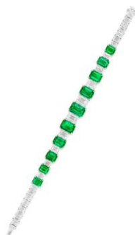
Colombian No Oil Emerald and Diamond Bracelet, emeralds totalling 16.51 carats Estimate: HK$1,800,000 - 3,000,000/ US$230,000 - 380,000