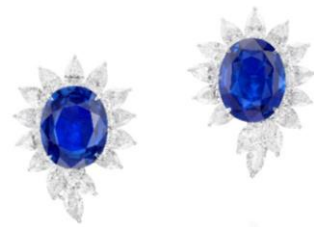
9.87 and 8.59-carat Burmese Unheated Sapphire and Diamond Earrings Estimate: HK$2,100,000 - 3,000,000/ US$270,000 - 385,000