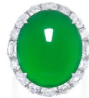
Jadeite and Diamond Ring Estimate: HK$450,000 - 650,000/ US$58,000 - 83,000

Hong Kong Jewels: Online Auction comprises an array of treasures at an exceptional value perfect for elevating your daily look. The sale features an eclectic mix of iconic pieces from renowned jewellers, combining elegance with everyday wearability. Whether it is adding a touch of sophistication to office attire or finding the perfect accessory for a casual outing, this auction is not to be missed.