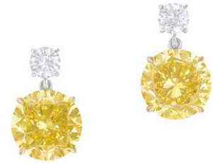
6.49 and 6.10-carat Fancy Intense Yellow Diamond and Diamond Ear Pendants Estimate: HK$2,750,000 - 4,300,000/ US$350,000 - 550,000