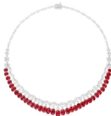
Burmese Unheated Ruby and Diamond Necklace, rubies totalling approximately 38.80 carats Estimate: HK$2,700,000 - 3,500,000/ US$350,000 - 450,000