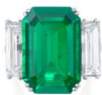
13.65-carat Colombian Emerald and Diamond Ring Estimate: HK$3,500,000 - 5,000,000/ US$450,000 - 650,000