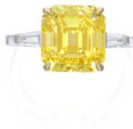
5.51-carat Fancy Vivid Yellow Diamond and Diamond Ring Estimate: HK$1,750,000 - 2,800,000/ US$220,000 - 350,000