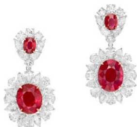
Burmese Unheated Ruby and Diamond Ear Pendants, rubies totalling 8.53 carats Estimate: HK$2,800,000 - 4,000,000/ US$360,000 - 500,000