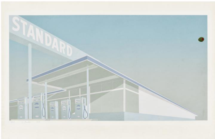
Ed Ruscha Cheese Mold Standard with Olive , 1969 Sold for $109,650

Combined Total for the Week: $1,230,015 / £901,166 / €1,034,071