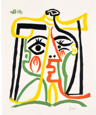
Pablo Picasso Portrait de Jacqueline au chapeau de paille (Portrait of Jacqueline in a Straw Hat) , 1962 Estimate: £100,000-150,000