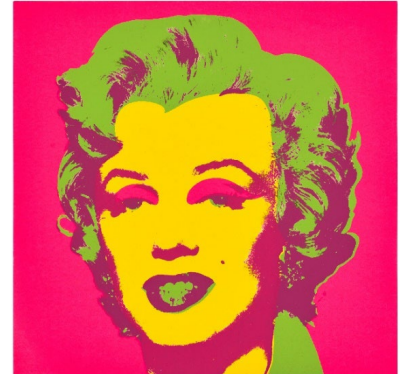
Andy Warhol Marilyn Monroe (Marilyn) , 1967 Estimate: £20,000-30,000