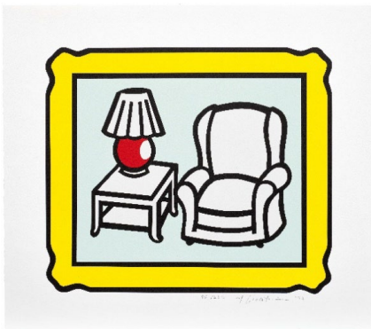
Roy Lichtenstein Red Lamp , 1992 Estimate: £12,000-18,000