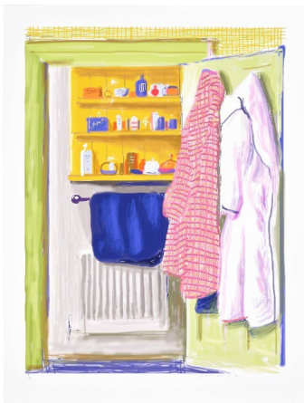
David Hockney Two Robes , 2010 Estimate: £40,000-60,000