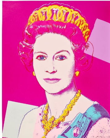
Andy Warhol Queen Elizabeth II of the United Kingdom , from Reigning Queens , 1985 Estimate: £100,000-150,000