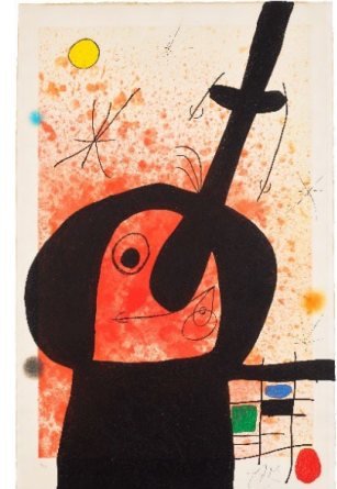
Joan Miró Le penseur puissant (The Mighty Thinker) , 1969 Estimate: £10,000-15,000