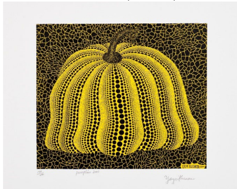
Yayoi Kusama Pumpkin 2000 (Yellow) , 2000 Estimate: £25,000-35,000