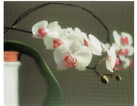
Gerhard Richter Orchidee II (Orchid II) , 1998 Estimate: £20,000-30,000