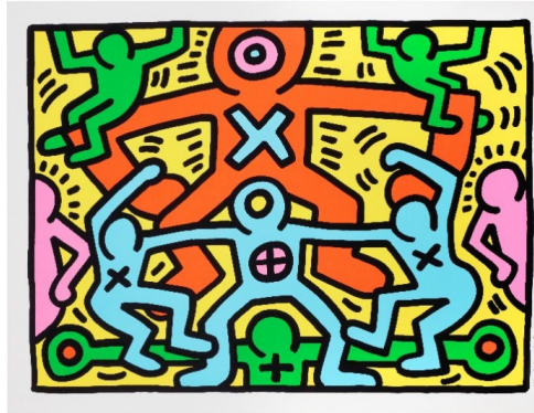
Keith Haring Untitled , 1985 Estimate: £20,000-30,000